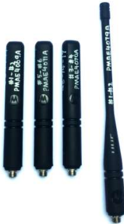
Left to Right: PMAE4069A, PMAE4071A, PMAE4070A, PMAE4079A