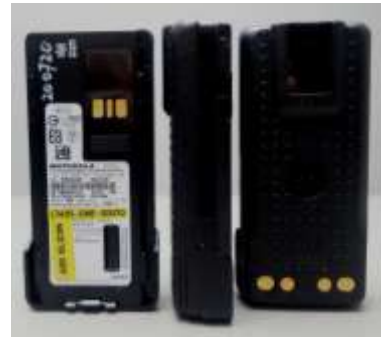
PMNN4448B (Front, side & back view)