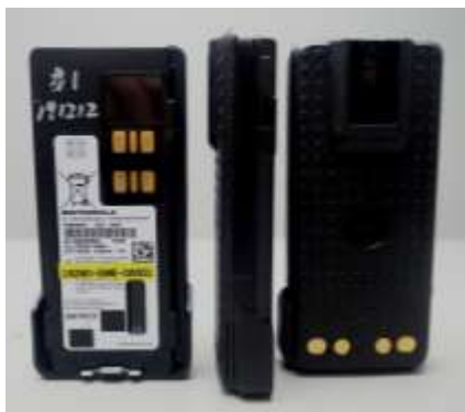
PMNN4491C (Front, side & back view)