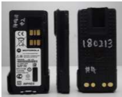
PMNN4407BR (Front, side & back view)