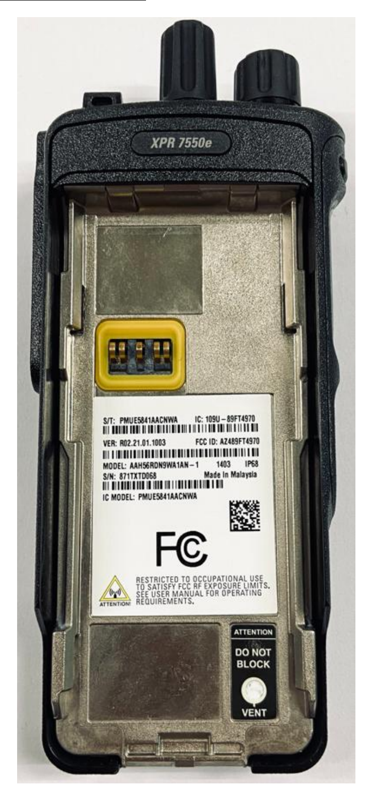
EXHIBIT 3C: BACK VIEW (FCC/IC LABELS)

Back View for Display and Full Keypad Model (FCC/IC label)