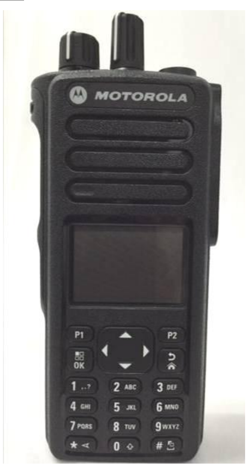
Front View with Display and Full Keypad Model