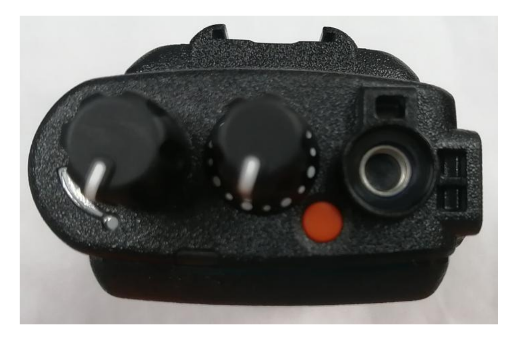
Top View for Full Keypad Model (without Antenna)