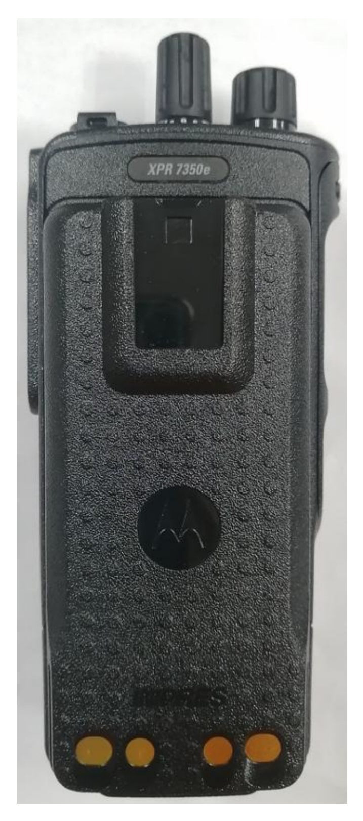
Back View with Battery for Non Keypad Plain Model