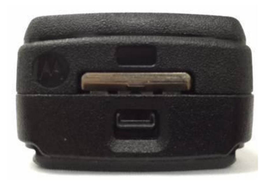
Exhibit 3G: BOTTOM VIEW

Bottom View with Battery for Full Keypad and Non Keypad Models