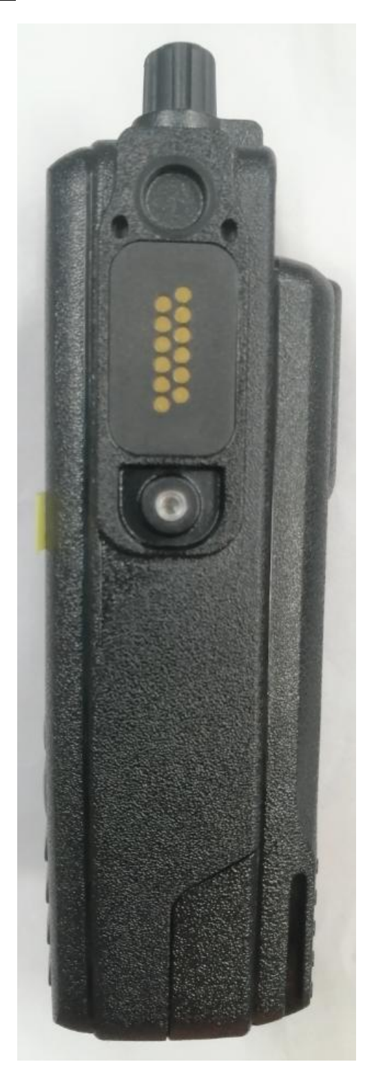
Side View for Full Keypad and Non Keypad Models (Left)