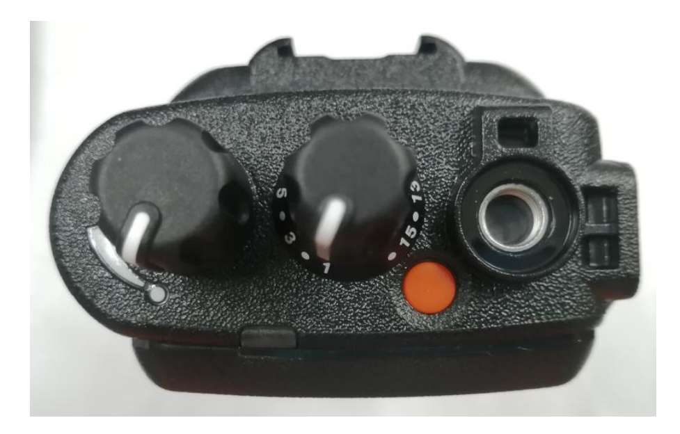
Top View for Non Keypad Model (without Antenna)