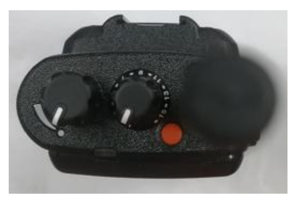
Top View for Non Keypad Model (with Antenna)