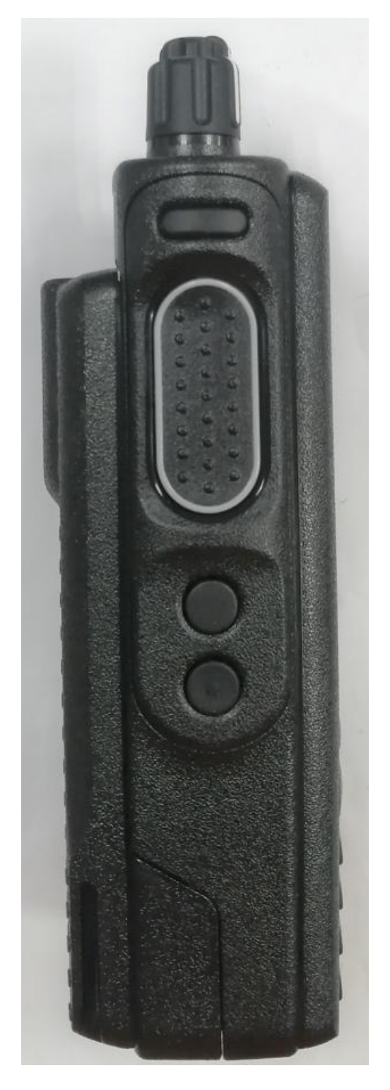
EXHIBIT 3D: SIDE VIEW (RIGHT)

Side View for Full Keypad and Non Keypad Models (Right)