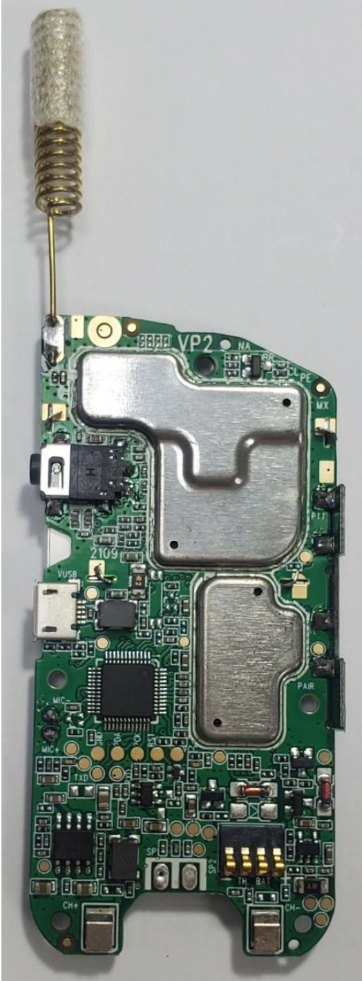
T383 & T380