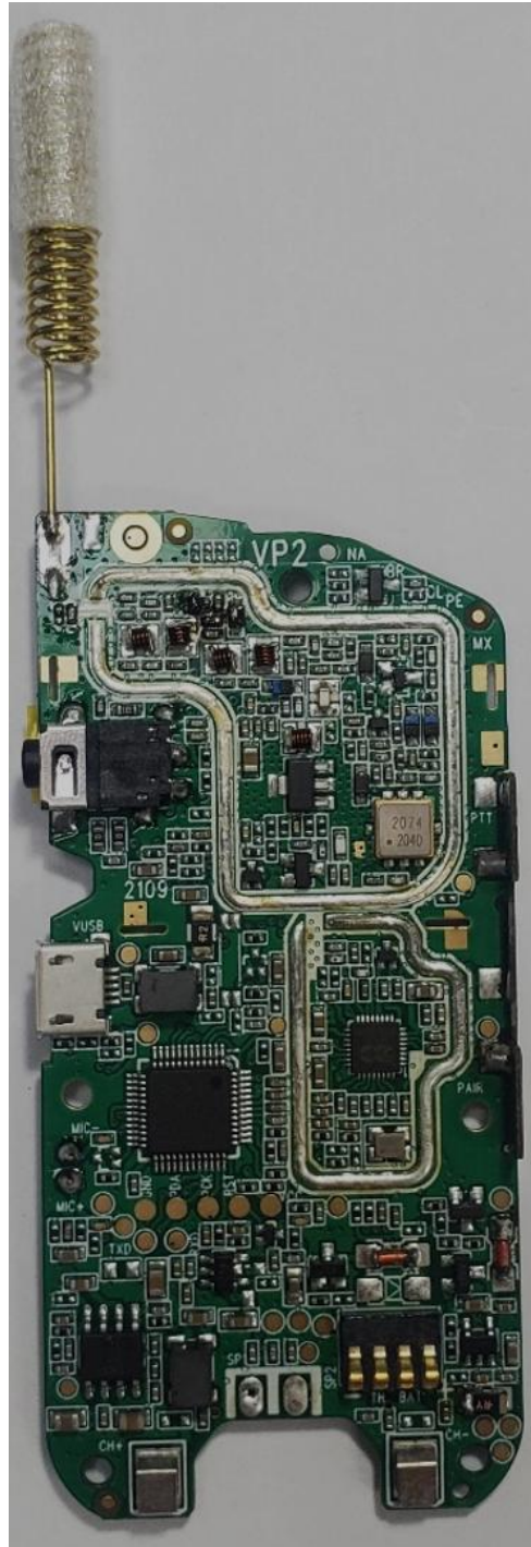
T383 & T380