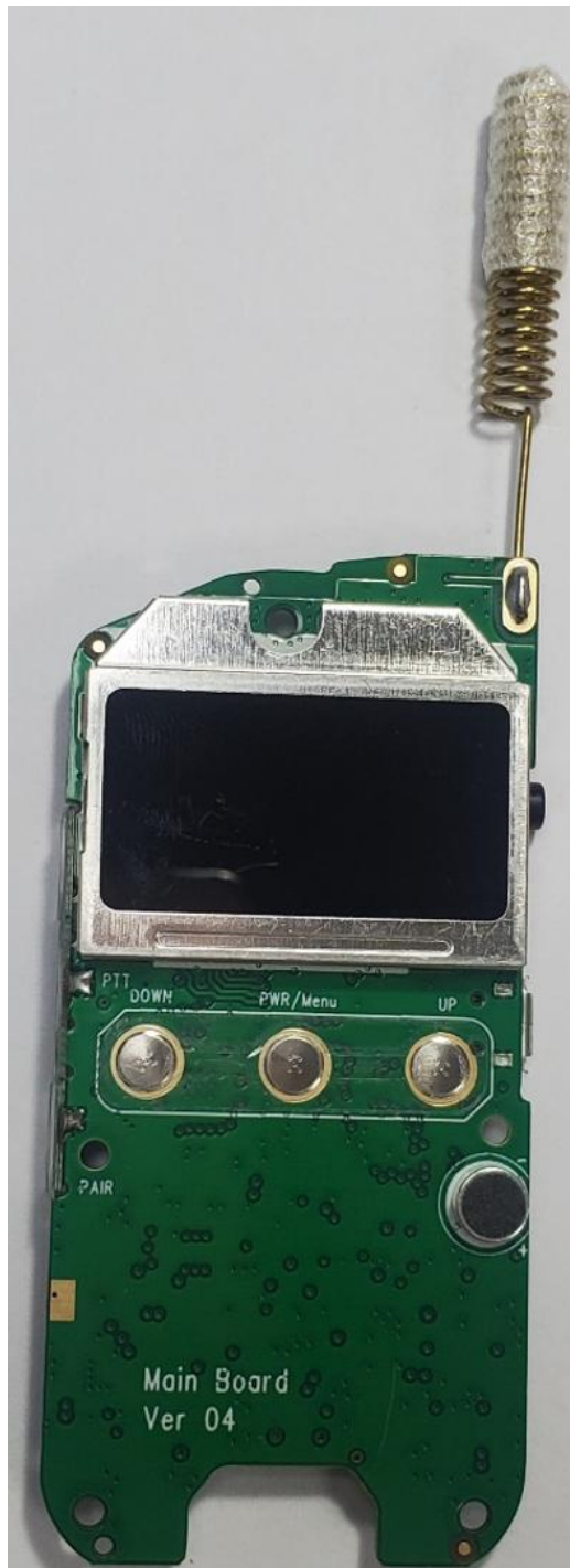
T383 & T380