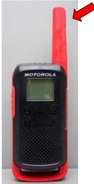
Fixed Antenna (front)