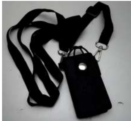
Carry Pouch PMLN7706A