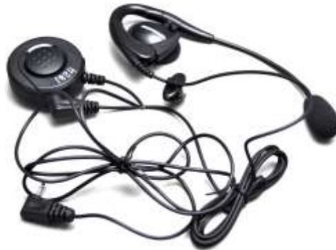
GU7140A (1884) Wired PTT button + Earpiece with Boom Microphone Bundle