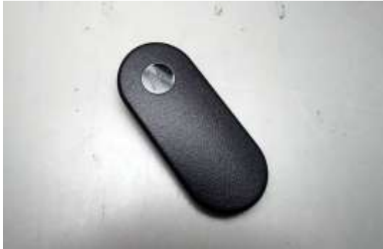
Belt clip 1564028V01 (PMLN7438A)