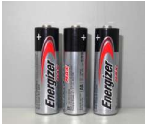
Battery AA Alkaline