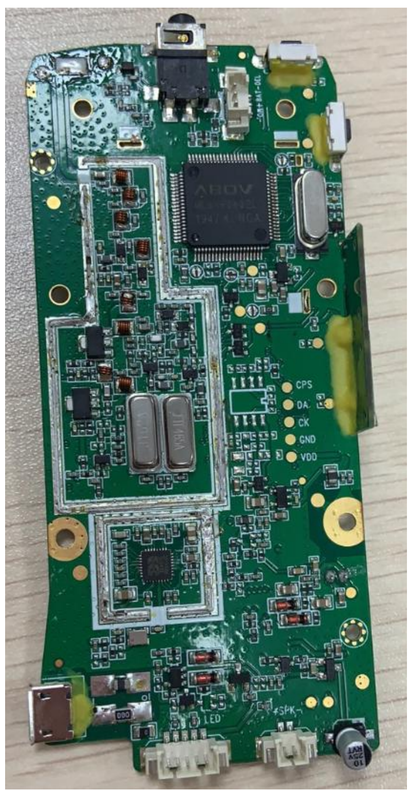
T600 / T605