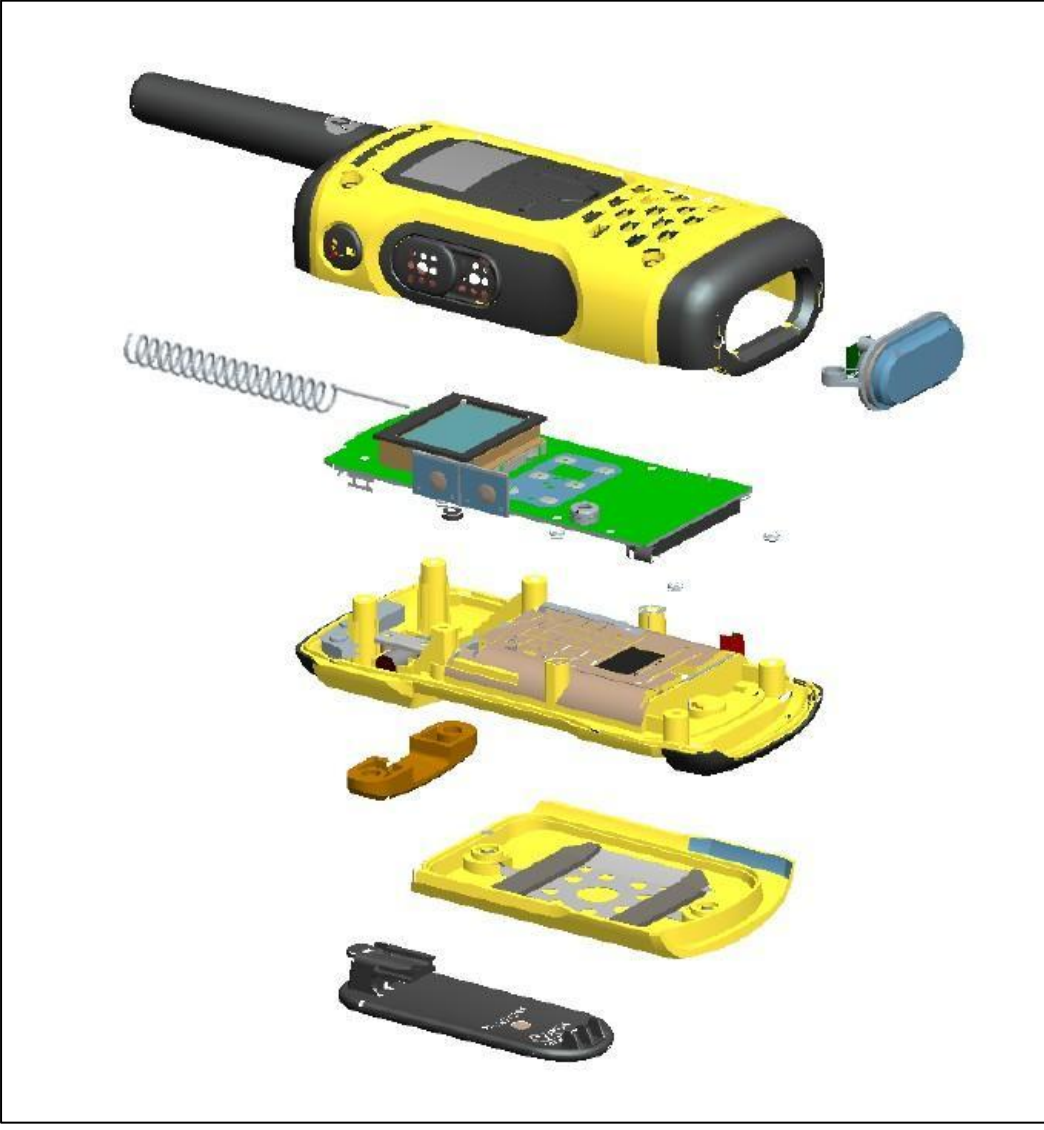
T600 / T605