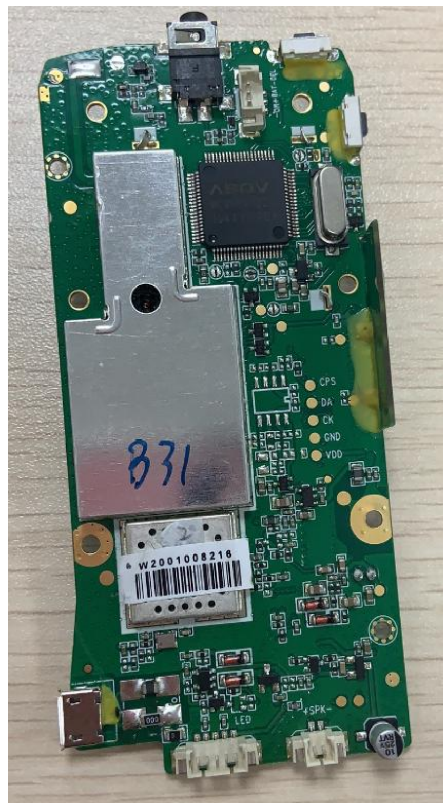
Exhibit 9C - RF board with Shields (Bottom)