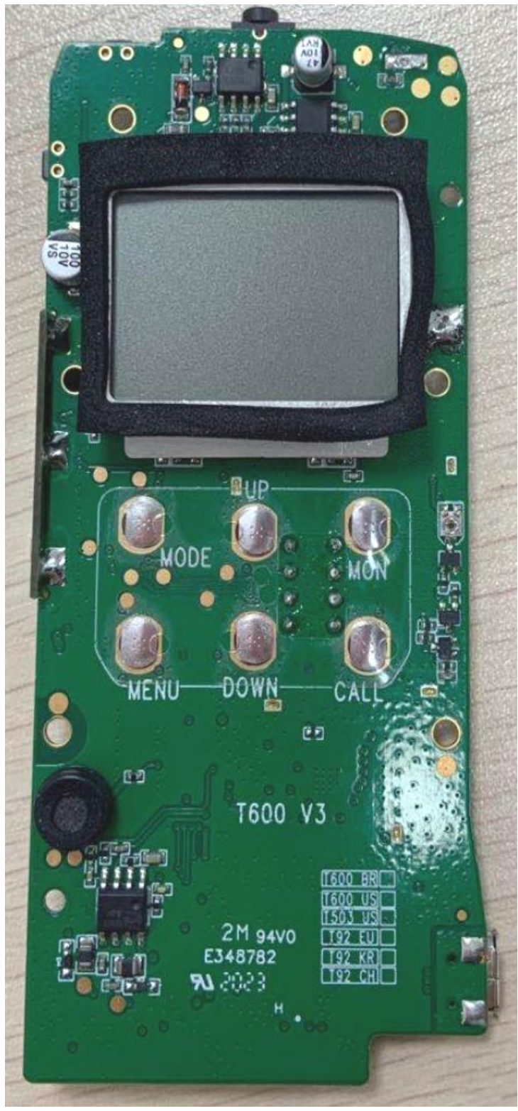
T600 / T605