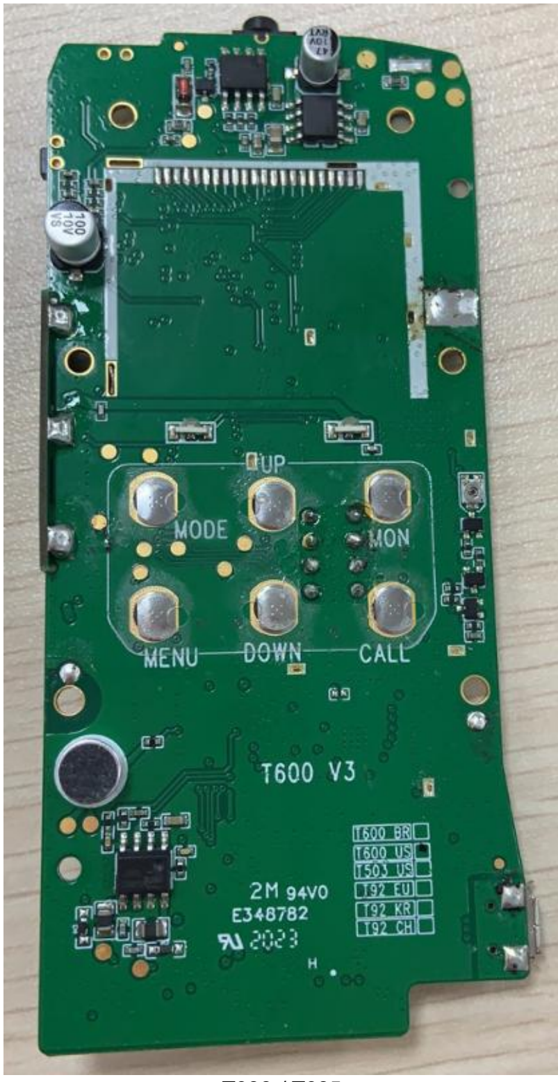
T600 / T605