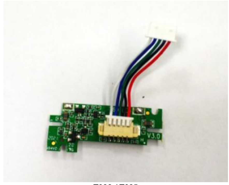
Exhibit 9H - Expander board without Shields (Bottom)