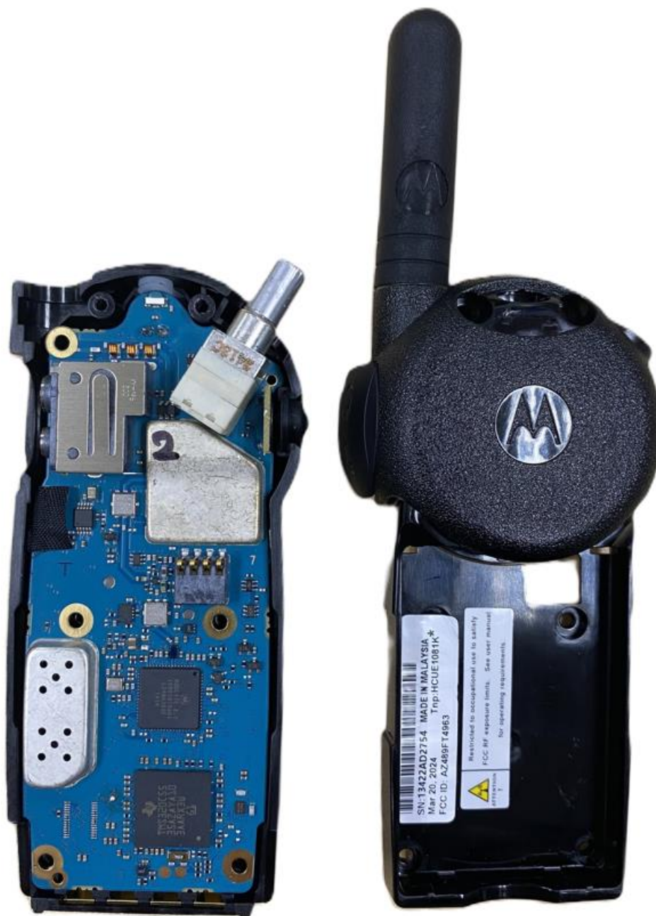
RF board with chassis and housing (Back Side) [VL50: P24VPC03D2BA] - Model canceled on 17 th November 2022