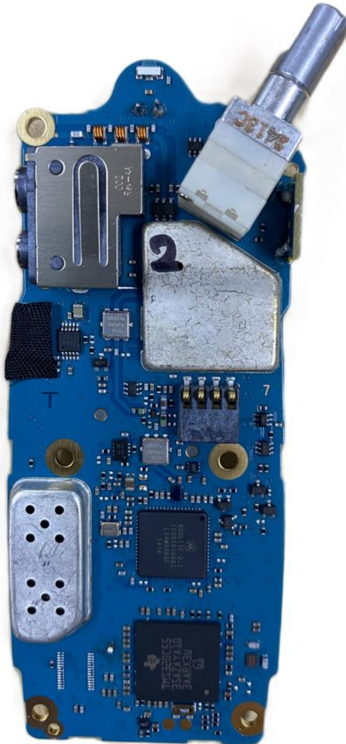
Exhibit 9C: RF board with Shields (Bottom)

Same for CLS1410, CLS1110, CLS1413, CLS1810T, VL50