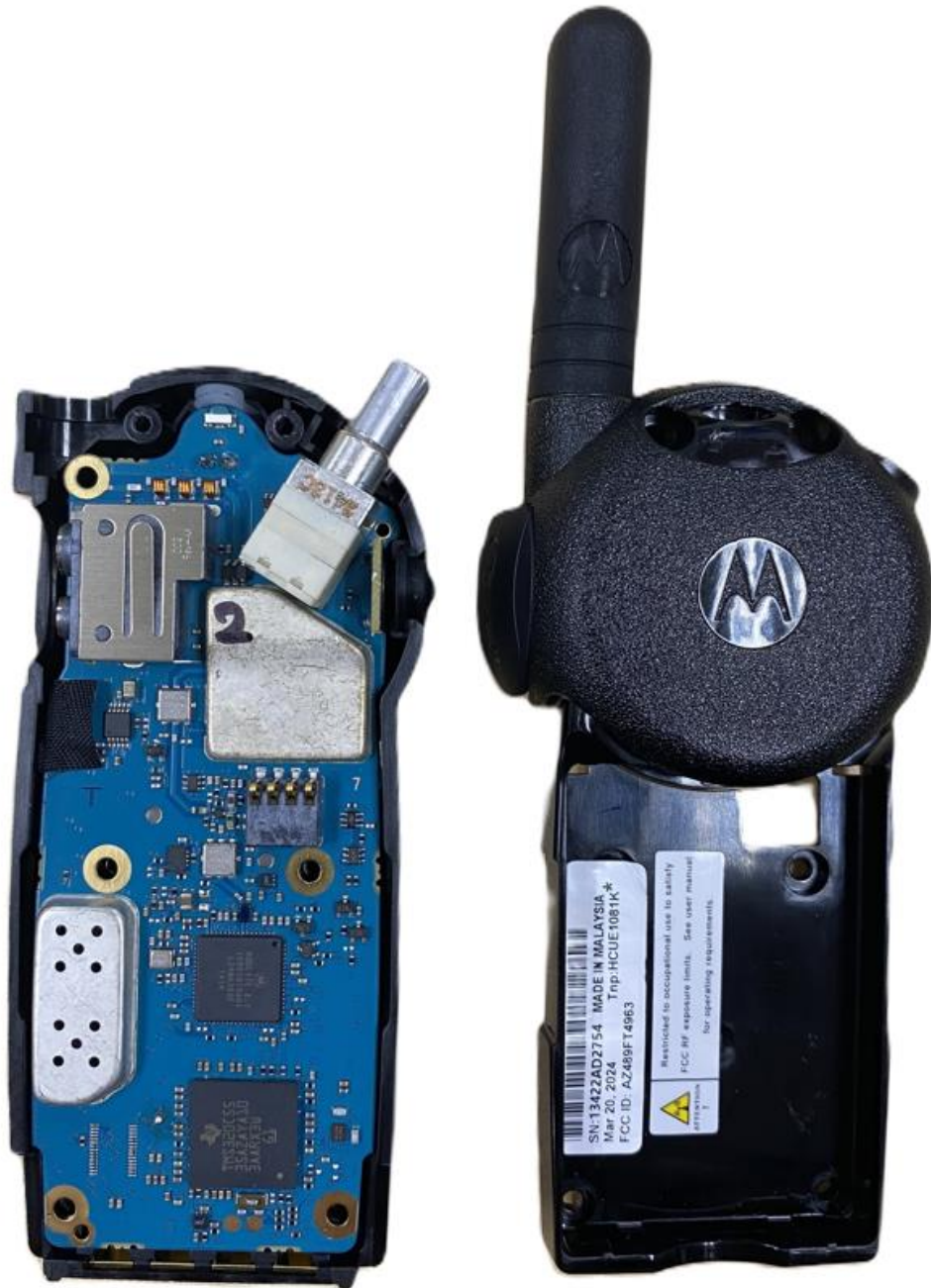
RF board with chassis and housing (Back Side) [CLS1410: CU1410BKV4BS] - Model canceled on 17 th November 2022