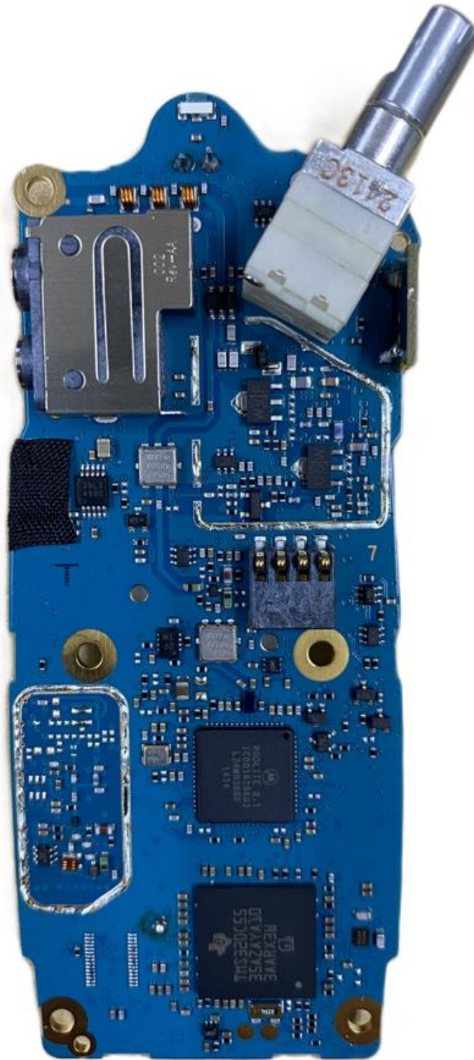
Exhibit 9D: RF board without Shields (Bottom)

Same for CLS1410, CLS1110, CLS1413, CLS1810T, VL50