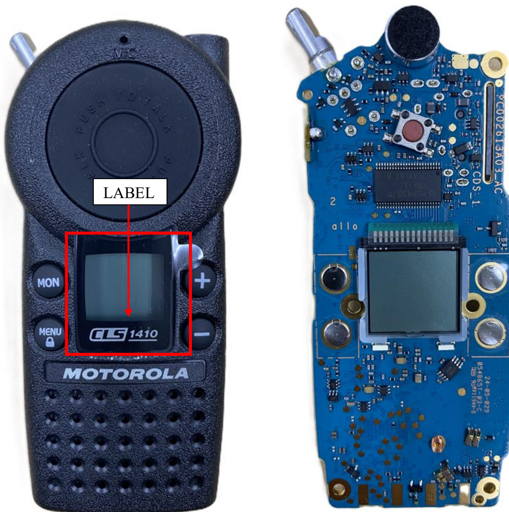
Exhibit 9E: RF boards with chassis and housing for (Front Side)

Same for CLS1410, CLS1110, CLS1413, CLS1810T, VL50. Only different in Label