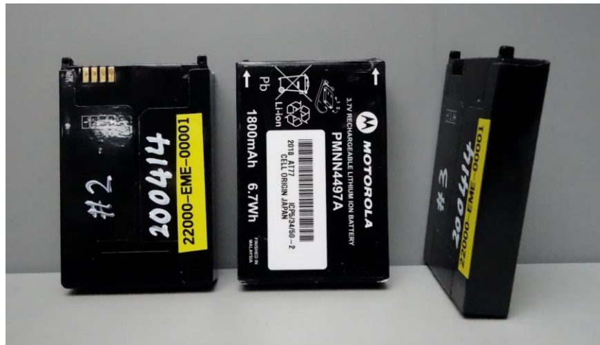
Battery Back, Front and Side View