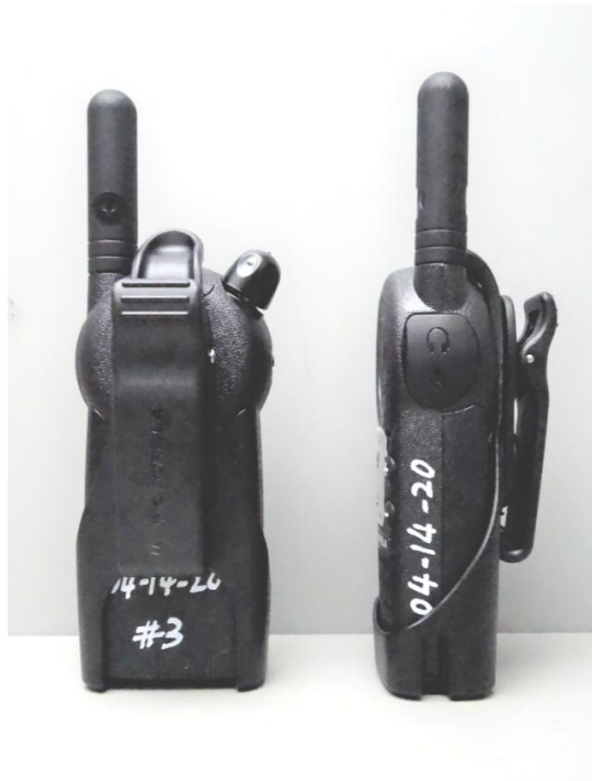
DUT back and side View with Belt Clip HCLN4013C