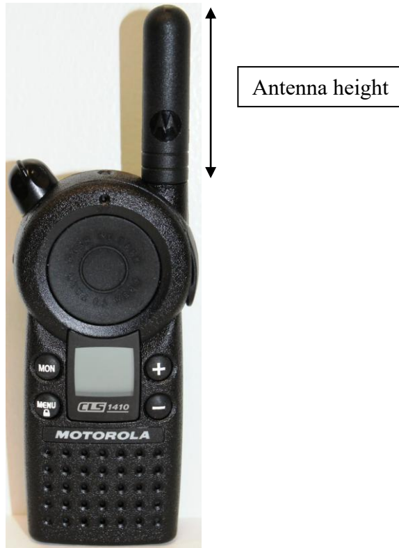
DUT with fixed antenna