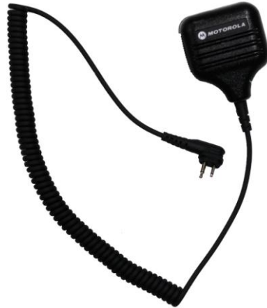
HKLN4606A Remote Speaker Microphone