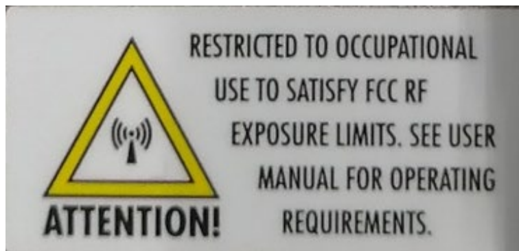
Figure 1: FCC Label for AAH56QDN9PA3AN / IC Label for PMUE4174ABCNAA