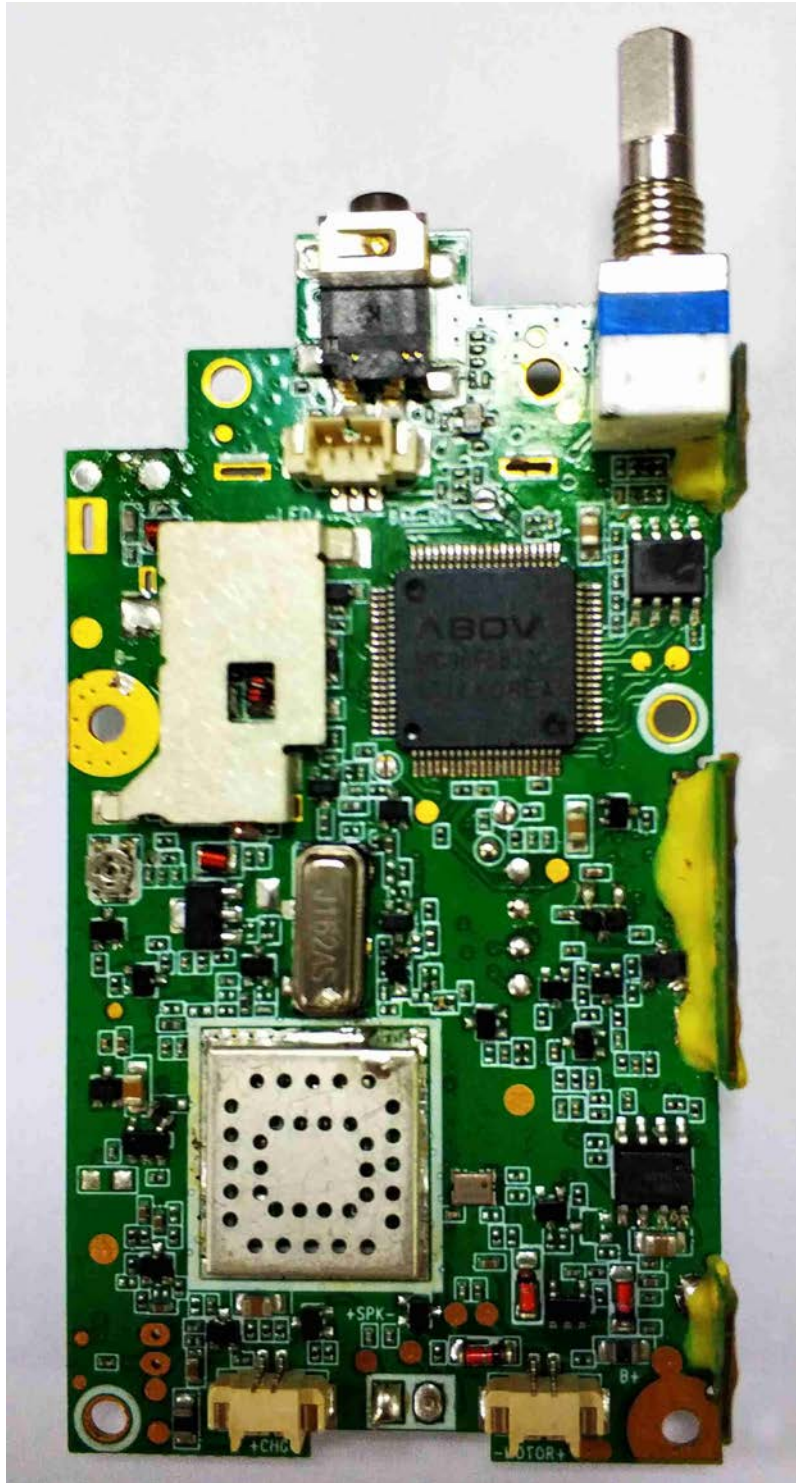
T402 / T460 / T465