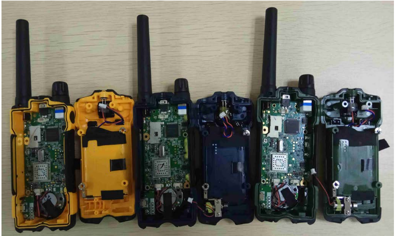
T402 / T460 / T465