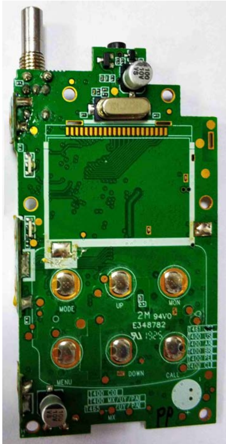
T402 / T460 / T465