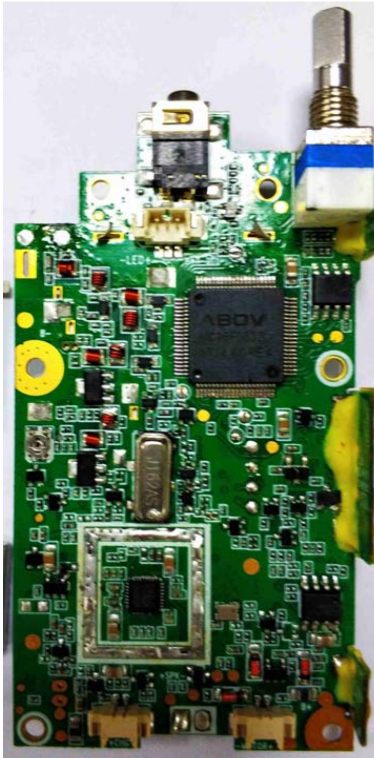
T402 / T460 / T465