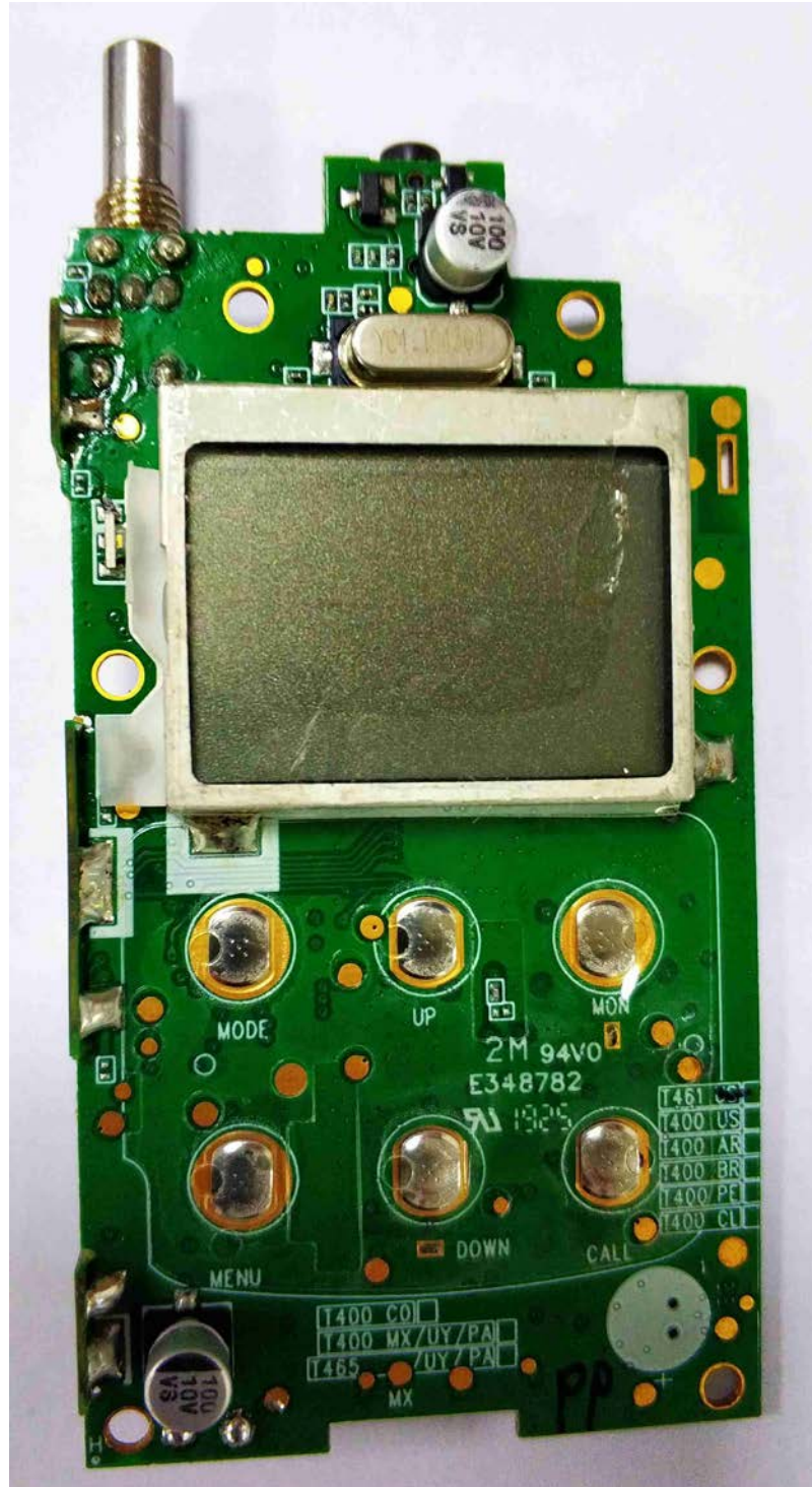
T402 / T460 / T465