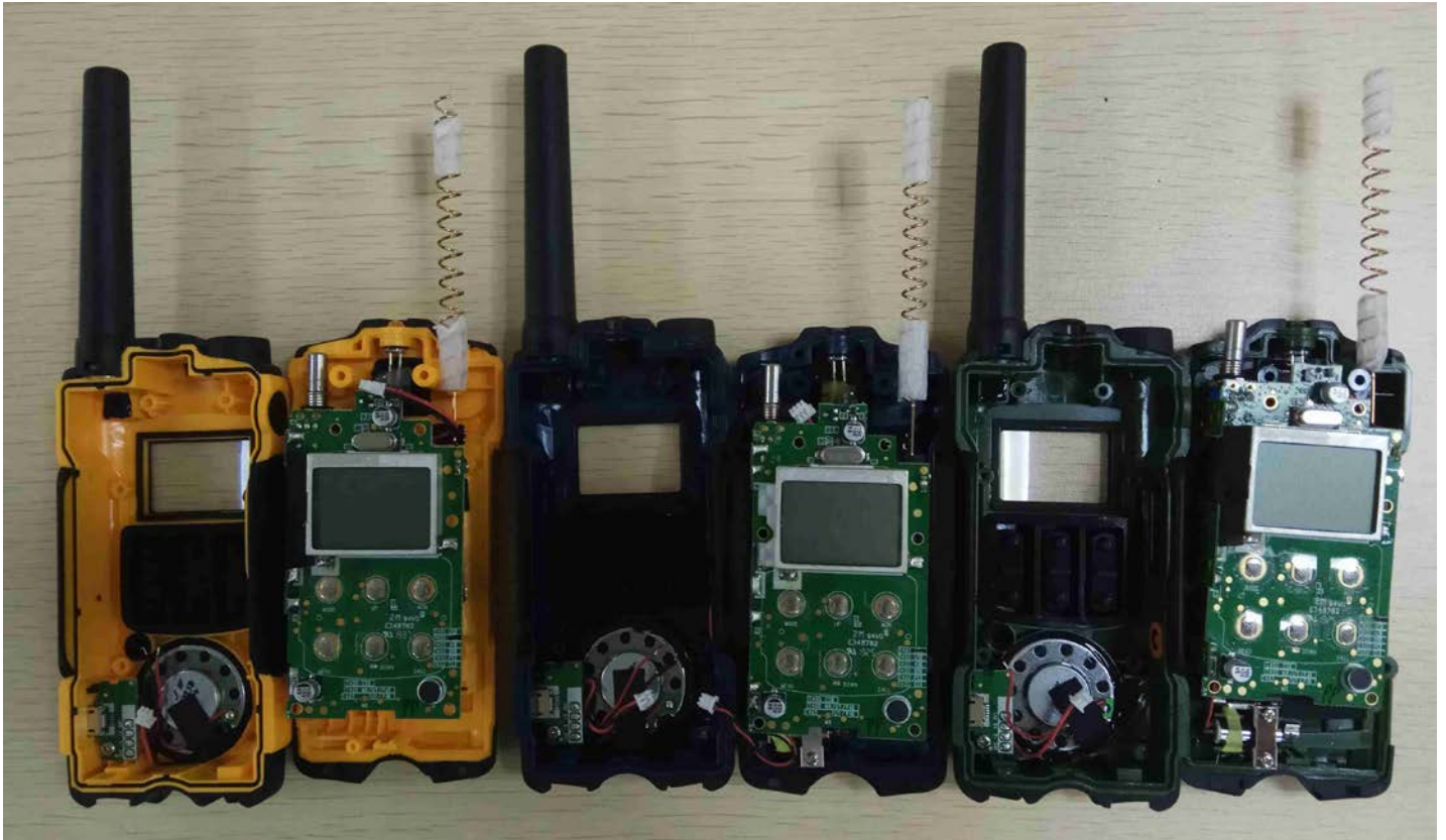
T402 / T460 / T465