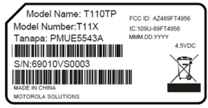
Figure 4: FCC/ IC label for T110TP (Gummy Lime)