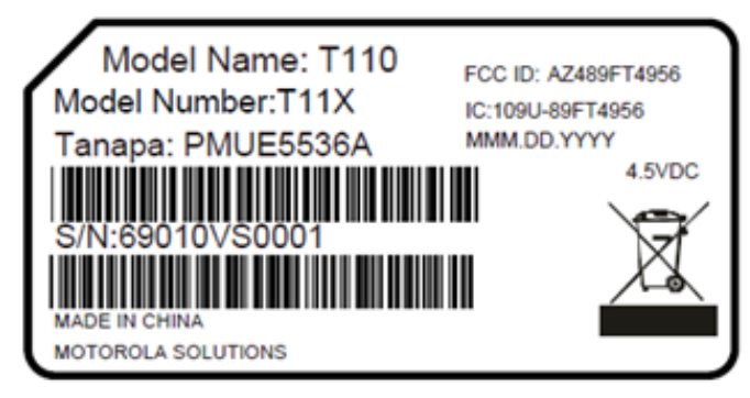
Figure1: FCC/ IC label for T110 (Red)