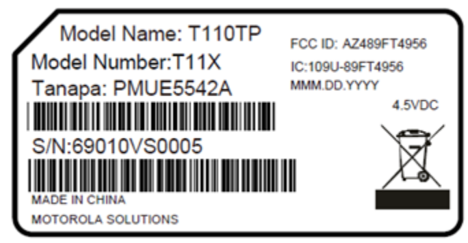
Figure 2: FCC/ IC label for T110TP (Gummy Orange)