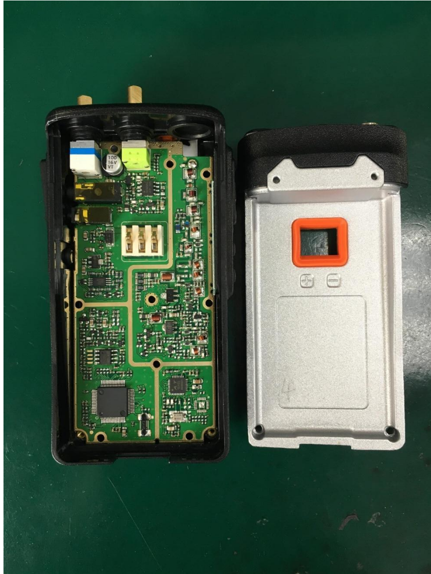
Chassis and housing (back side)