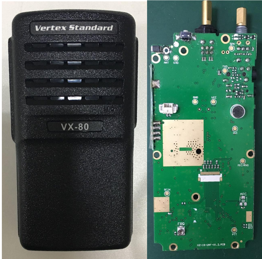
RF Board with Chassis and housing (front side)