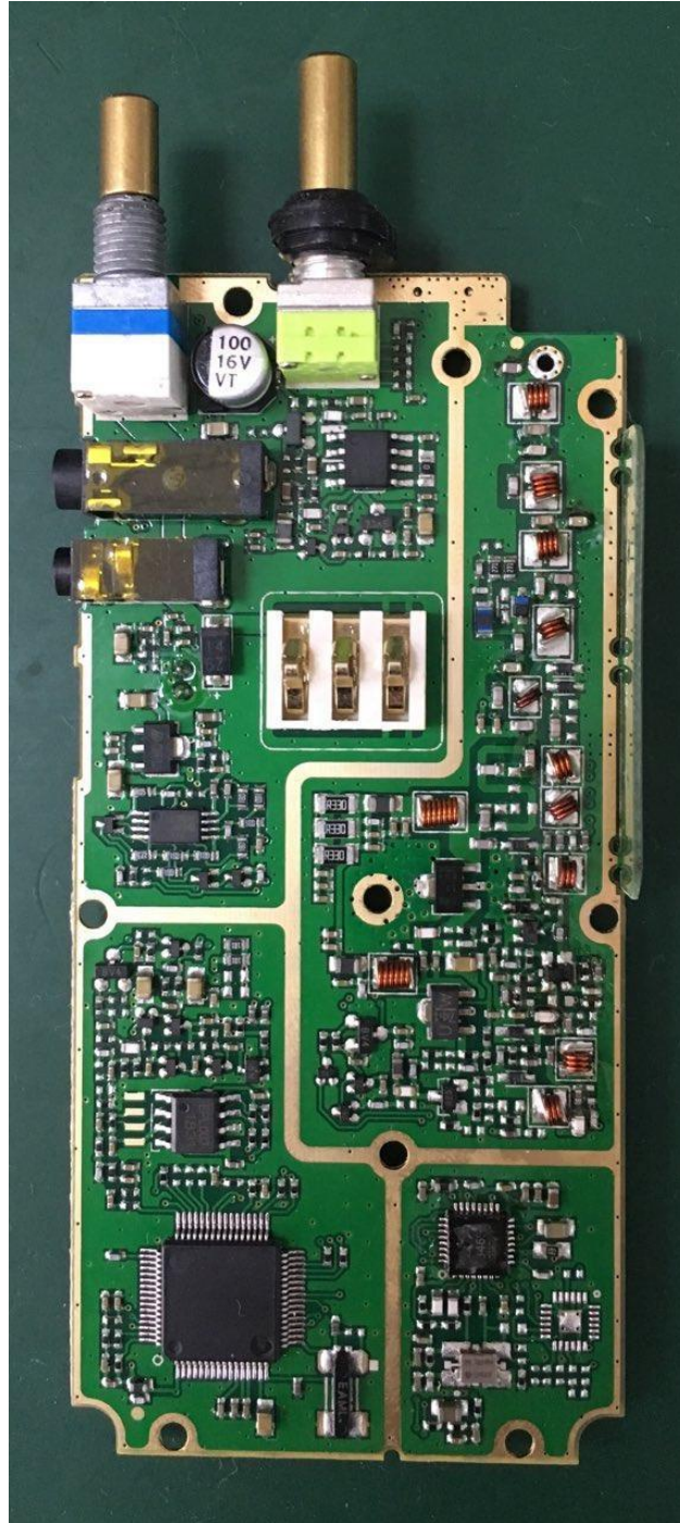
RF Board (Bottom)