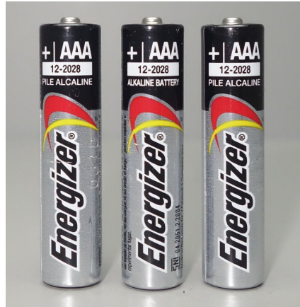
3x AAA Alkaline battery