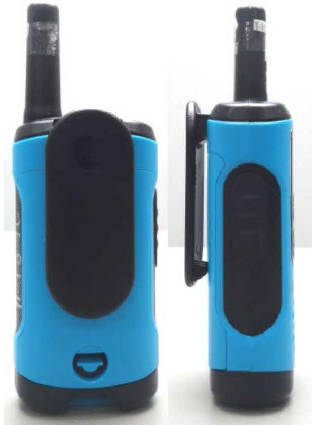
1564028V01 Belt Clip (Back and Side view)