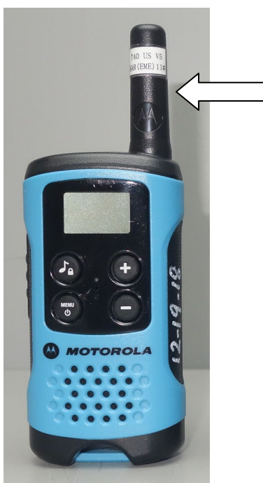
Fixed Antenna pointed with arrow