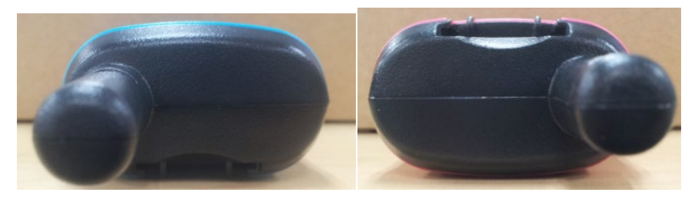
Exhibit 3F – Top View