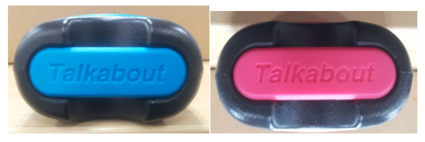
Exhibit 3G – Bottom View