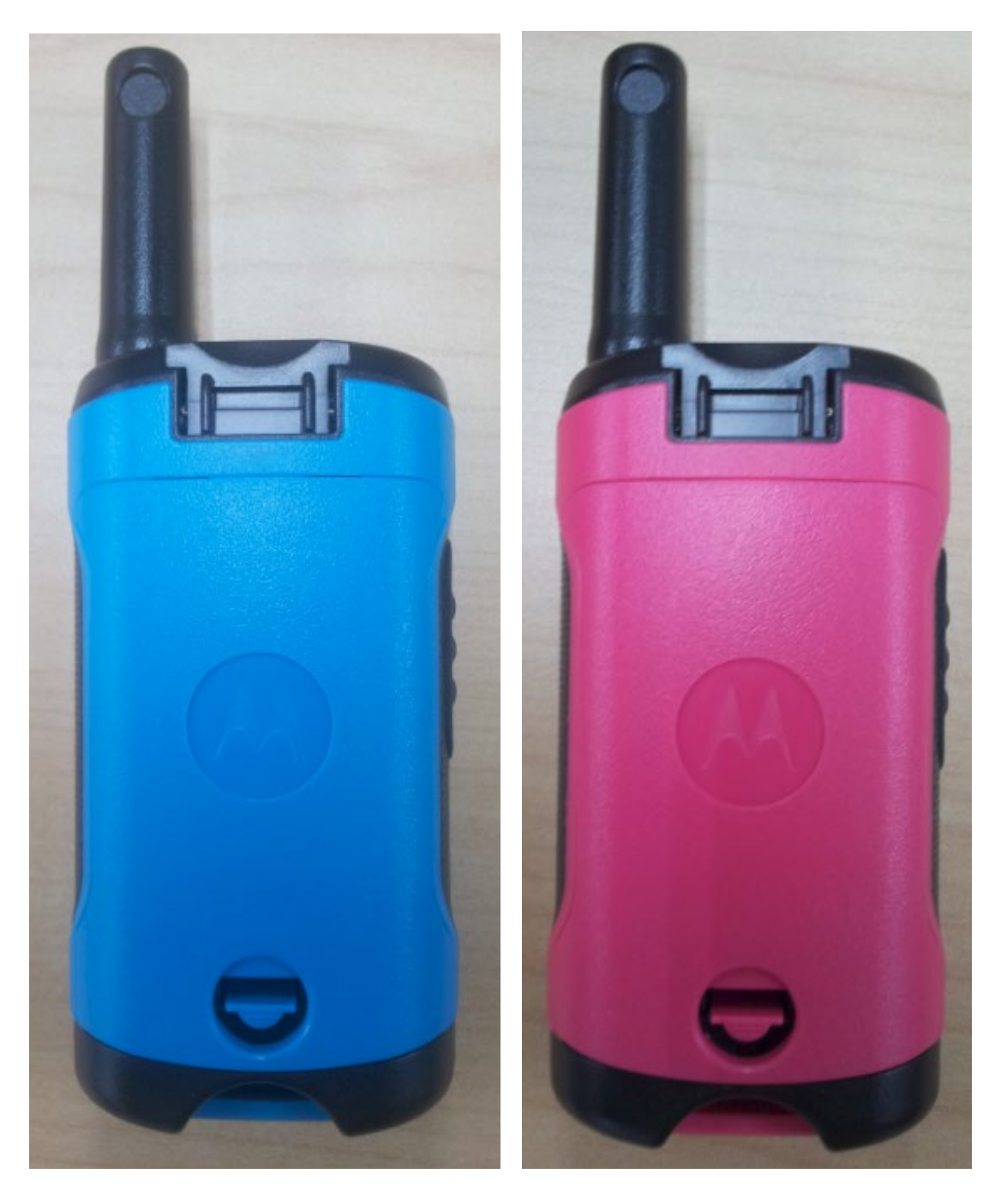
Exhibit 3B – Back View with Battery Cover