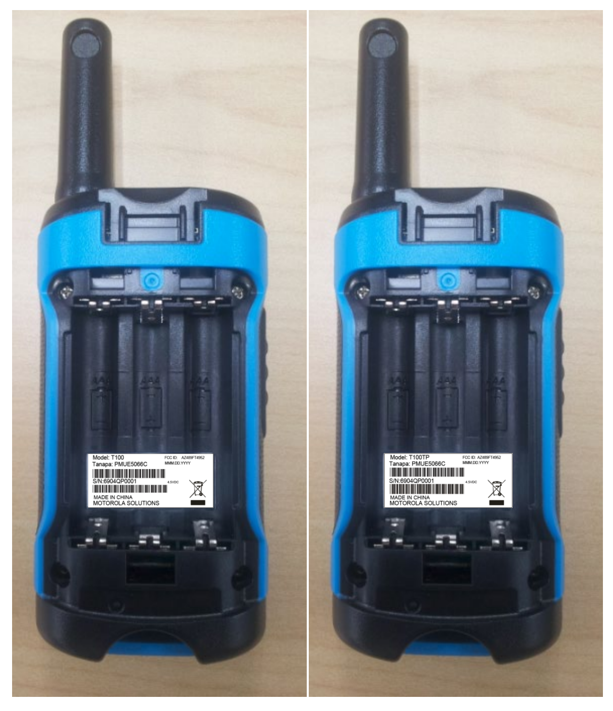
Exhibit 3C – Back View (FCC / ISED Label Location)