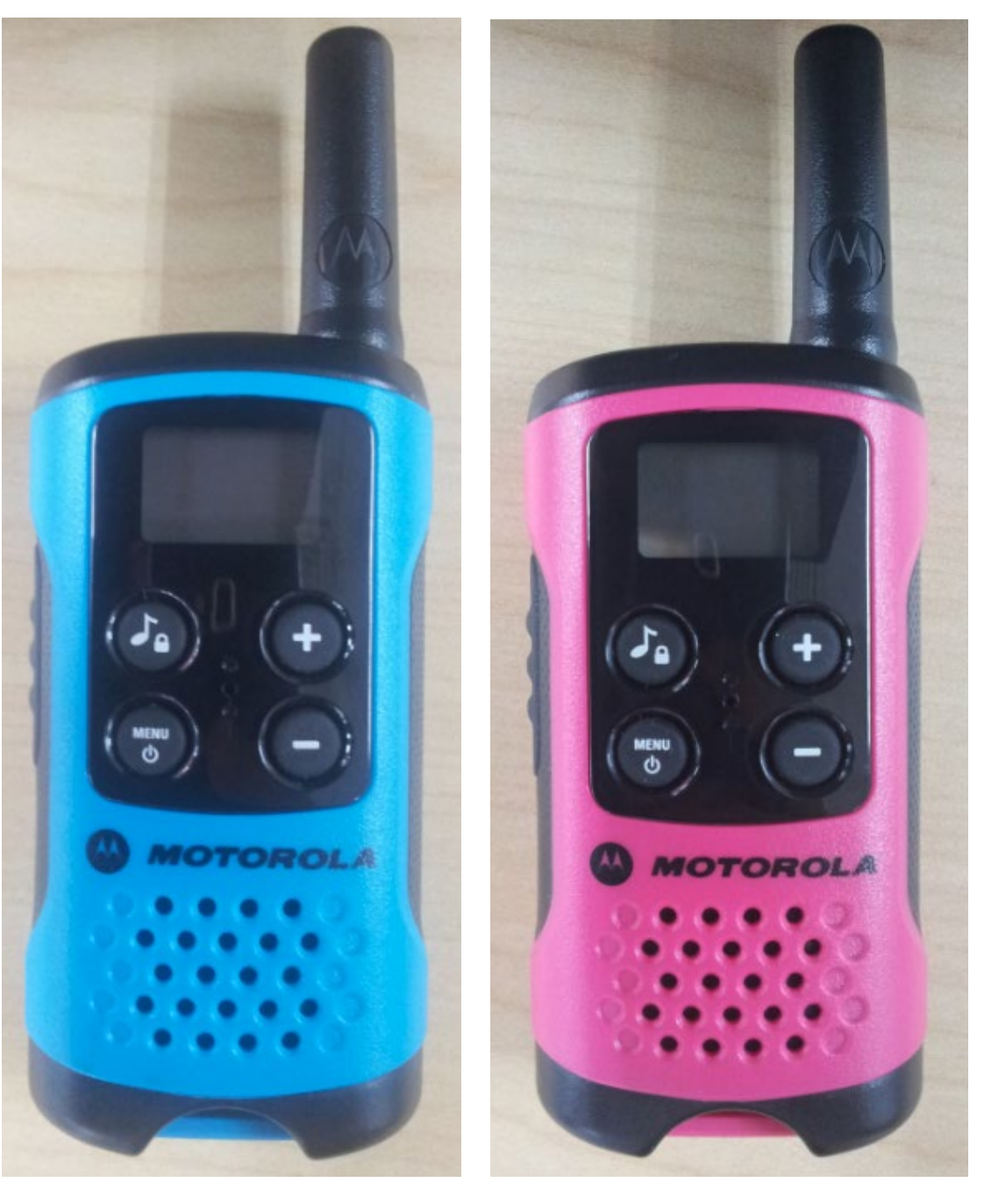
Exhibit 3A – Front View with Display and Keypad