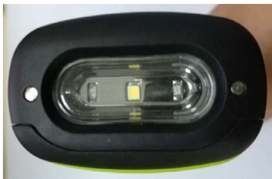
T6B22201GWRAAW & T6B22201GWCAAG