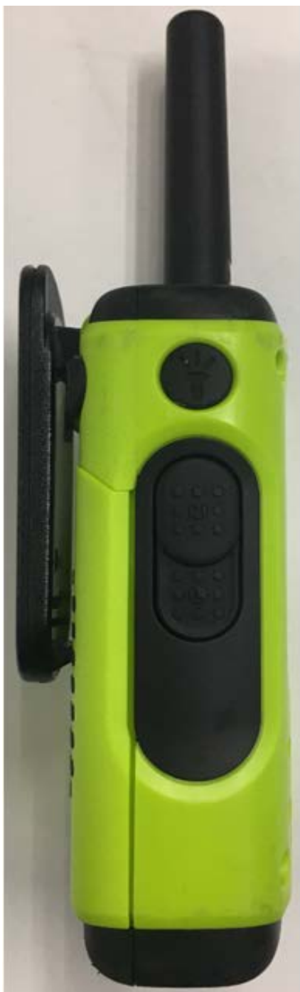
T6B22201GWRAAW & T6B22201GWCAAG