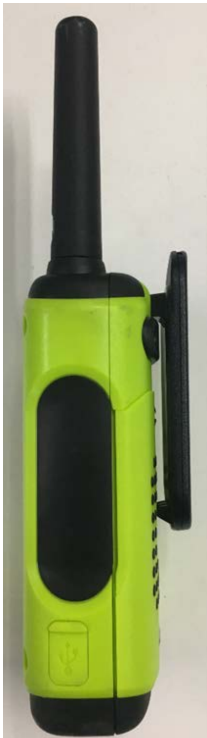
T6B22201GWRAAW & T6B22201GWCAAG