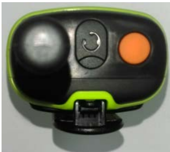
T6B22201GWRAAW & T6B22201GWCAAG