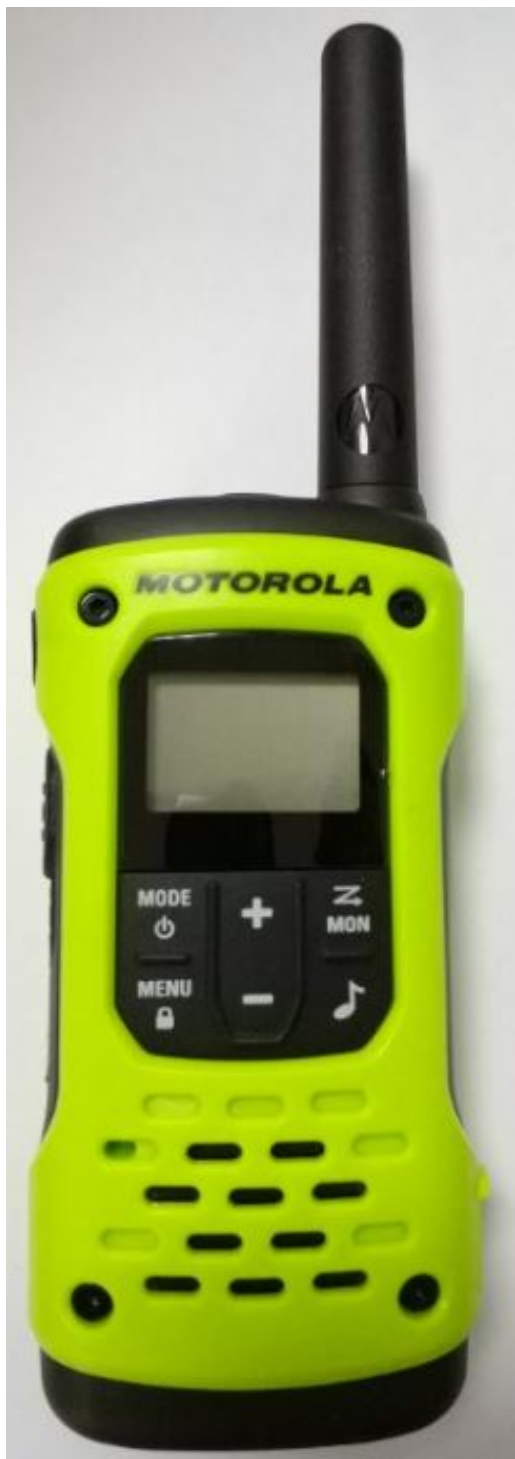
T6B22201GWRAAW & T6B22201GWCAAG