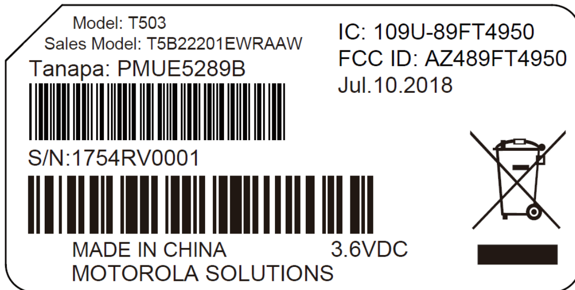
Figure 3: FCC IC Label for Sales model T5B22201EWRAAW