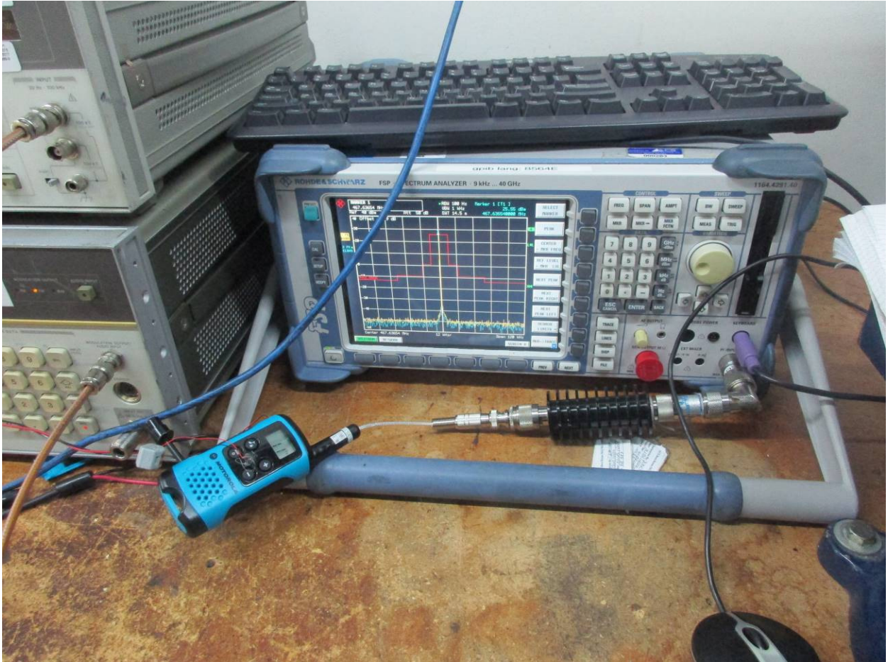
Figure 6: RF Conducted Emissions