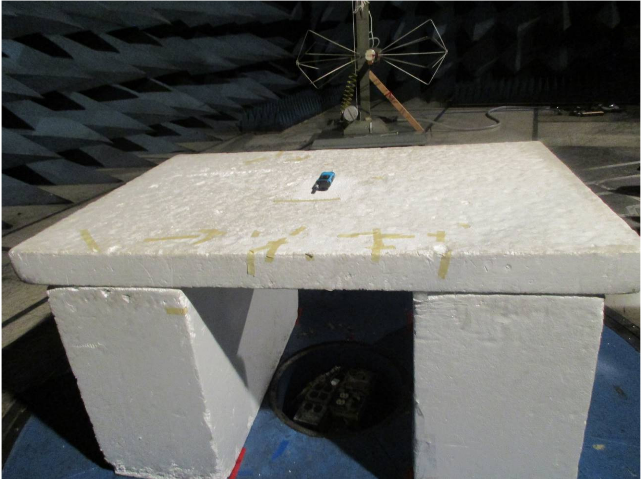
Figure 2: Radiated Emissions – Back View (30 MHz – 200 GHz)