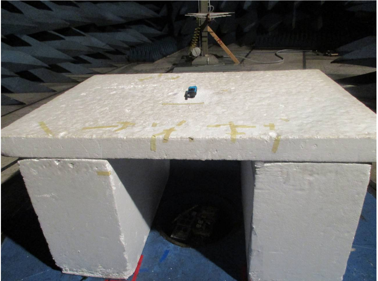
Figure 3: Radiated Emissions – Back View (200 MHz – 1 GHz)