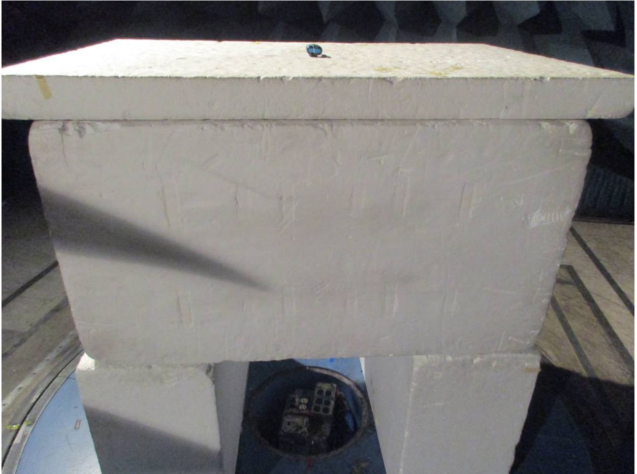
Figure 4: Radiated Emissions – Front View (Above 1 GHz)