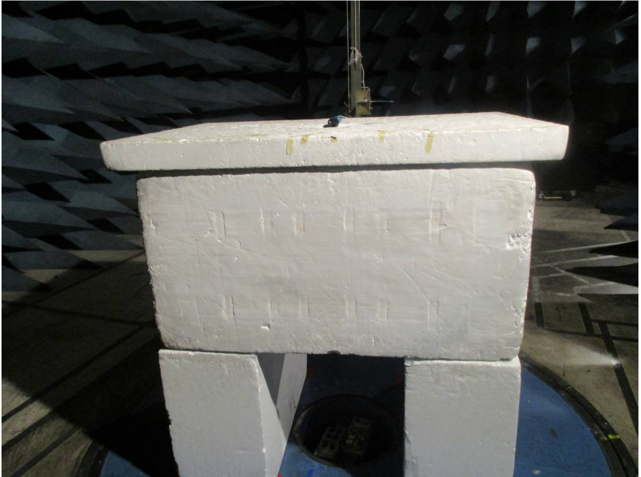
Figure 5: Radiated Emissions – Back View (Above 1 GHz)