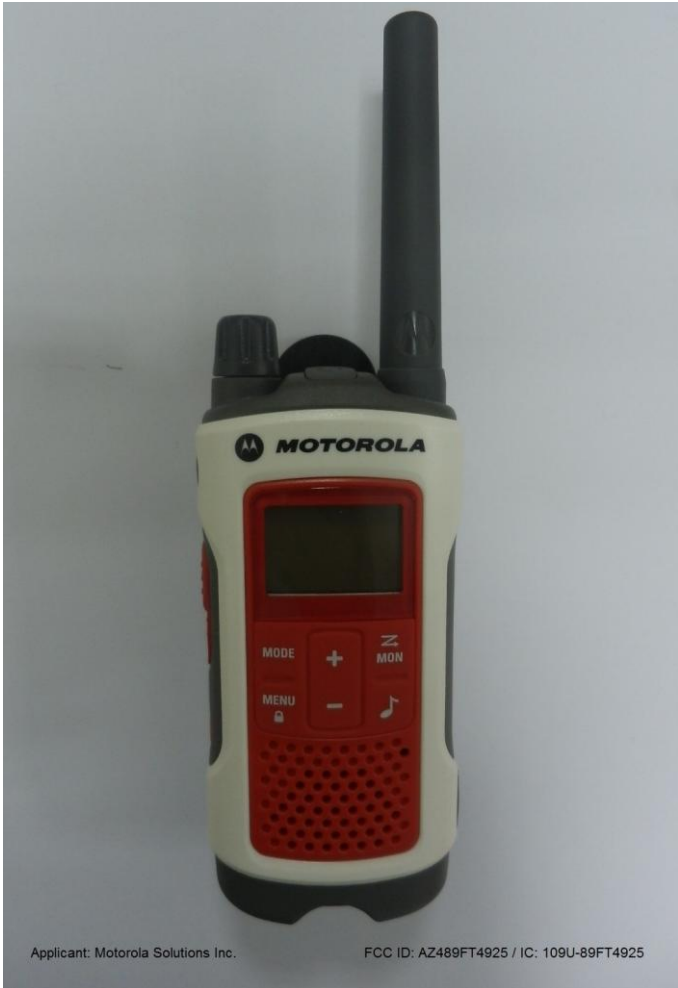
Applicant: Motorola Solutions Inc.