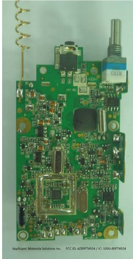
T461 / T400 / T460 / T465