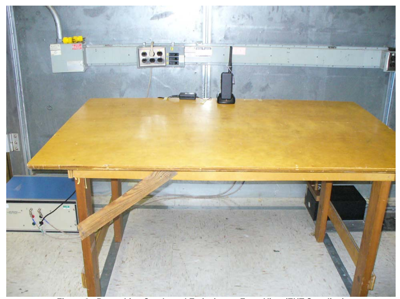
Figure 8: Power Line Conducted Emissions – Front View (EUT Standing)