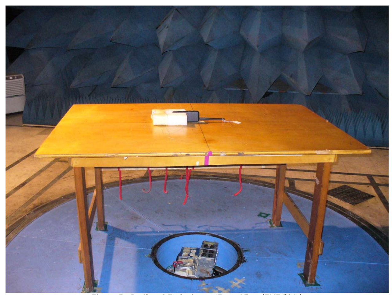
Figure 5: Radiated Emissions – Front View (EUT Side)