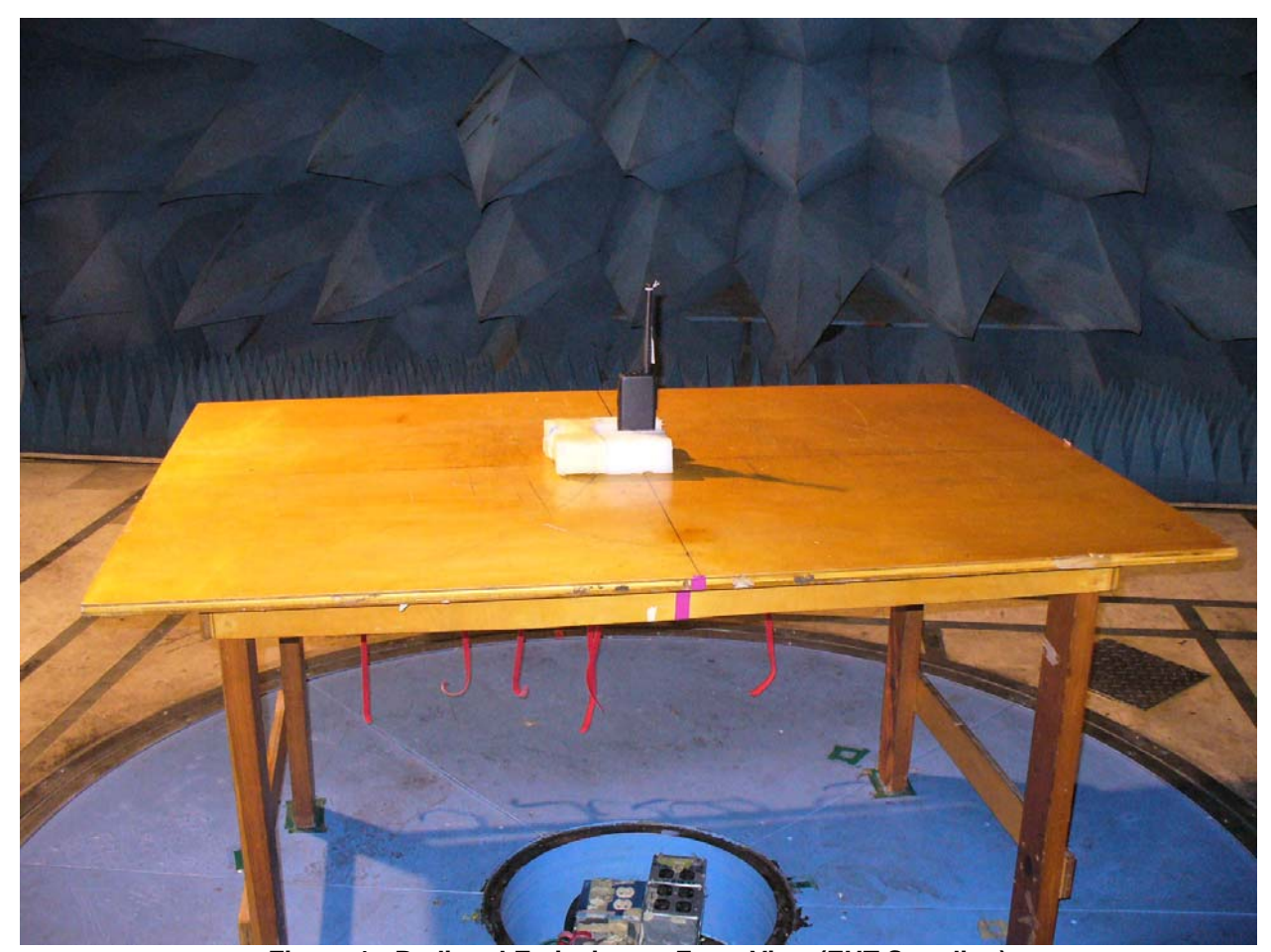
Figure 1: Radiated Emissions – Front View (EUT Standing)