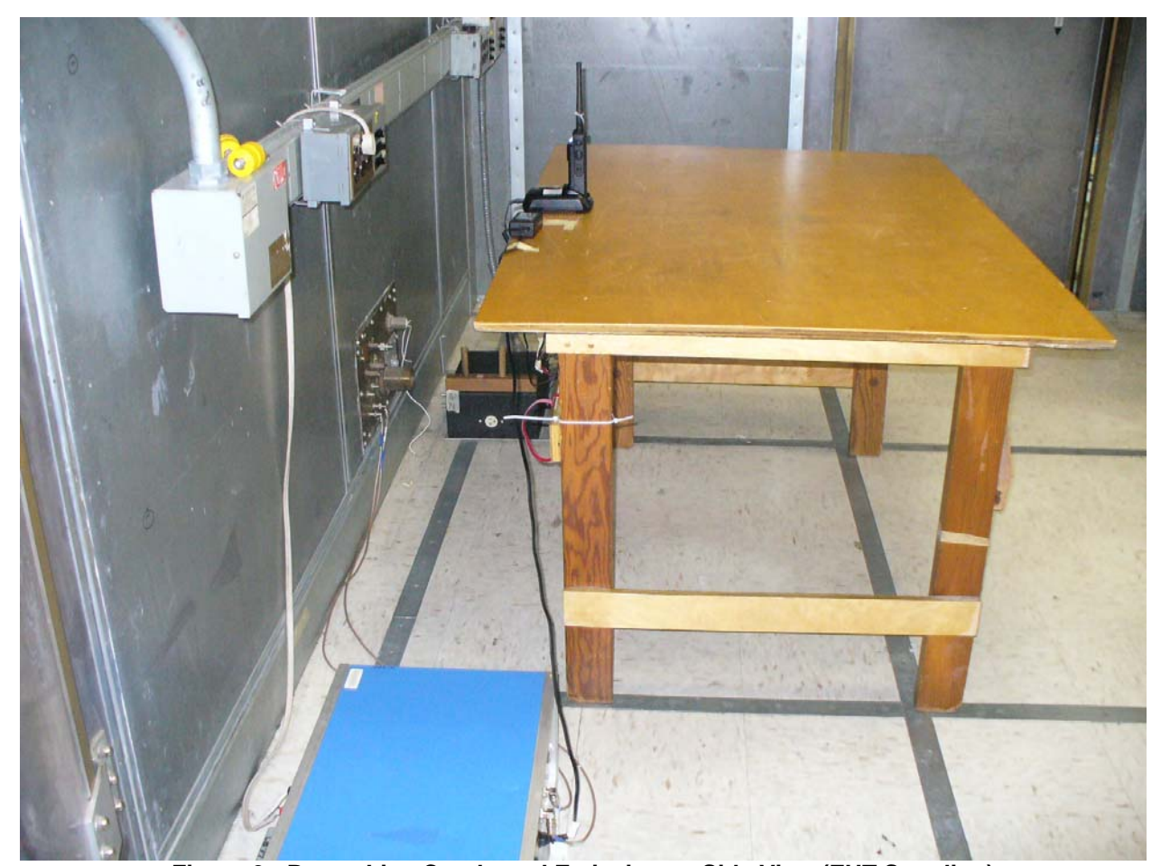
Figure 9: Power Line Conducted Emissions – Side View (EUT Standing)