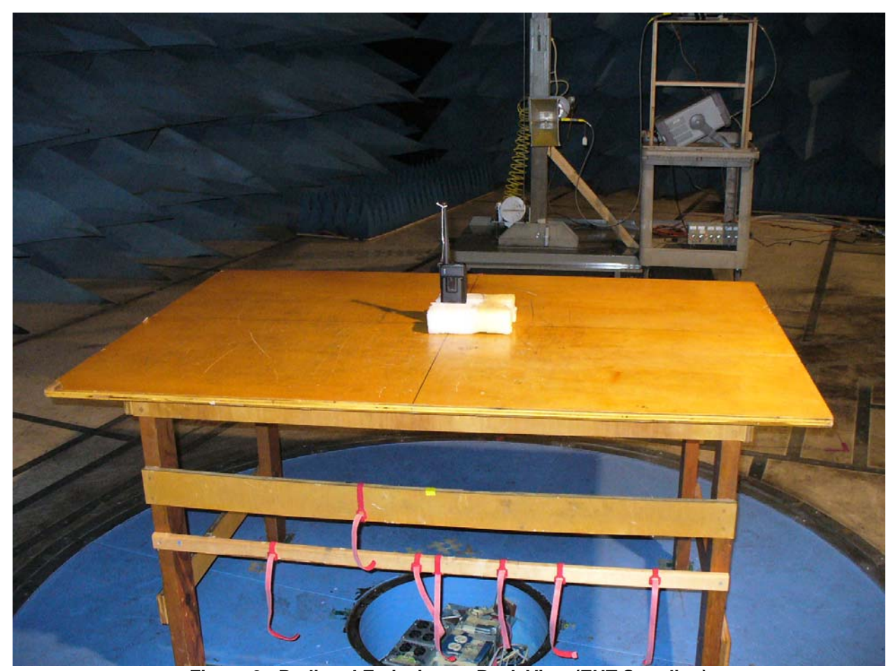
Figure 2: Radiated Emissions – Back View (EUT Standing)