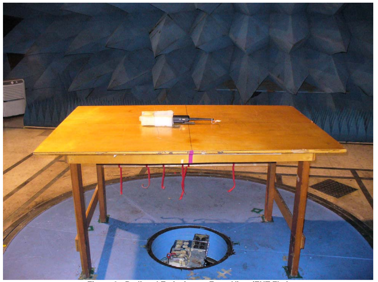
Figure 3: Radiated Emissions – Front View (EUT Flat)