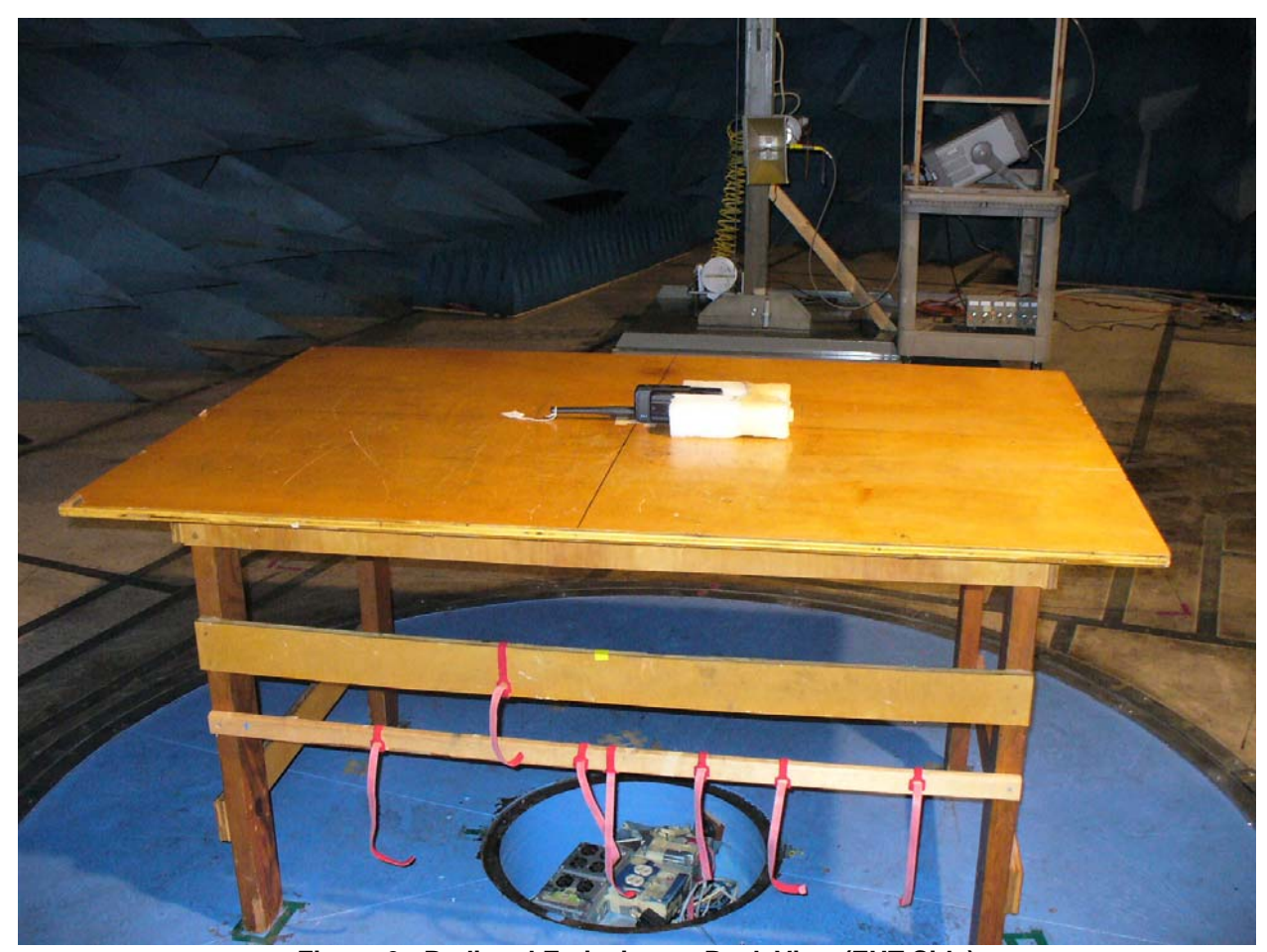
Figure 6: Radiated Emissions – Back View (EUT Side)