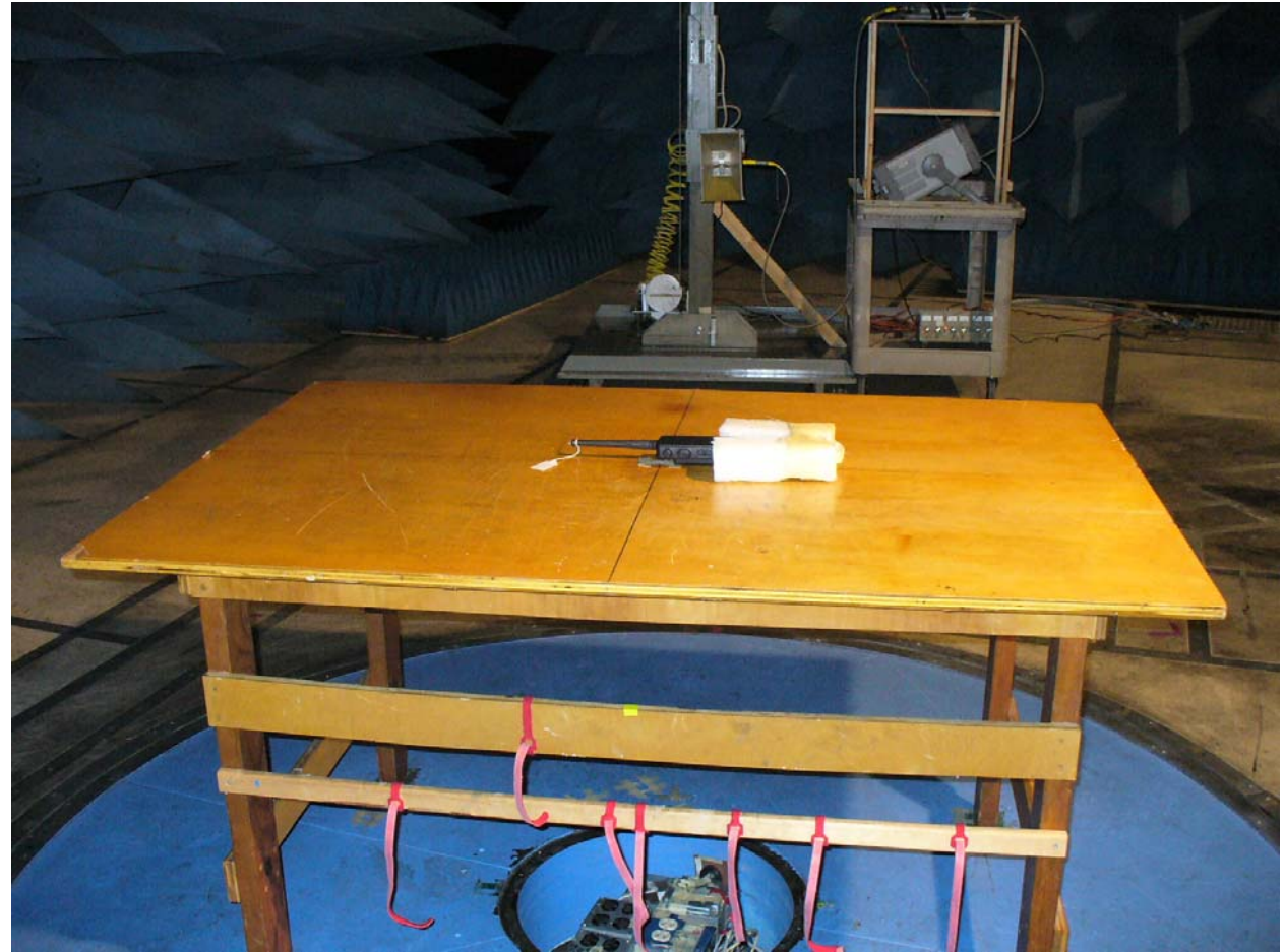
Figure 4: Radiated Emissions – Back View (EUT Flat)