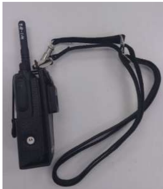
PMLN8434A Hard Leather without belt loop with NTN5243A Strap