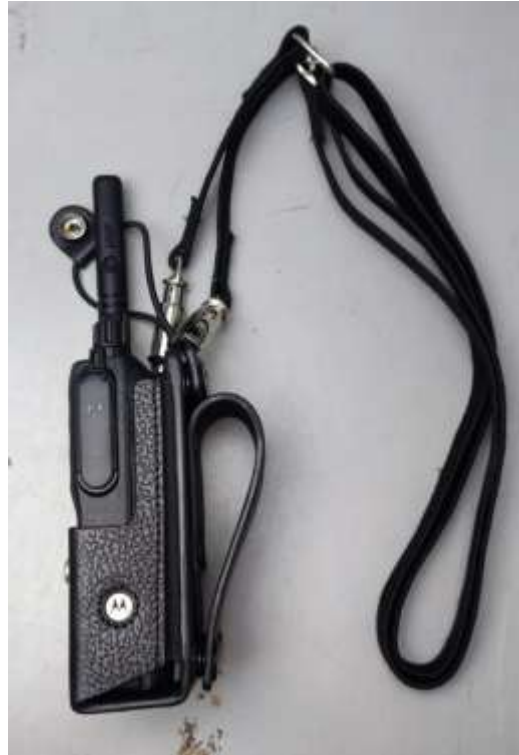
PMLN8433A Hard Leather with NTN5243A Strap