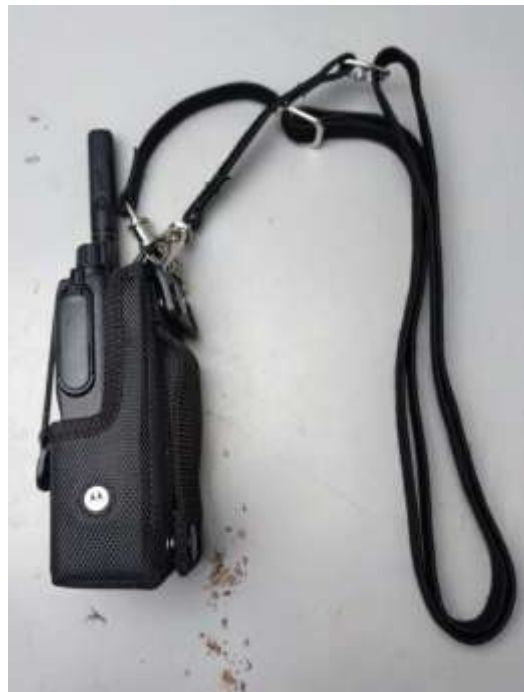
PMLN8427A Nylon with NTN5243A Strap