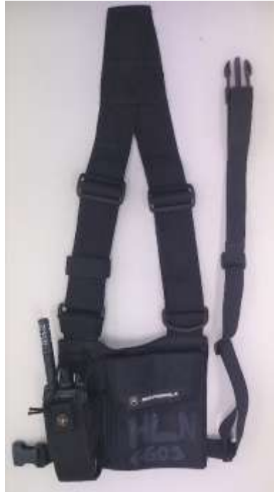
HLN6602A Chest pack