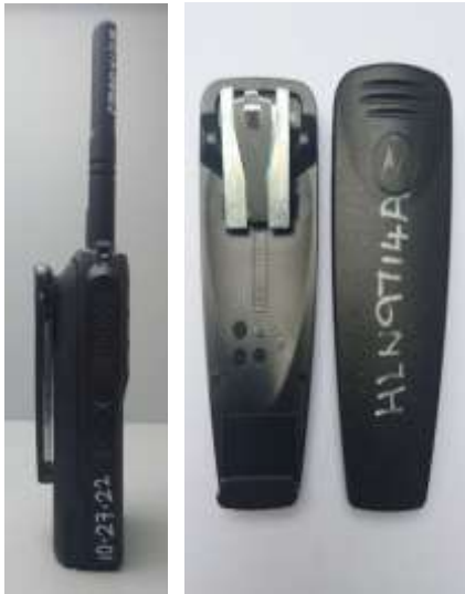
HLN9714A Belt Clip