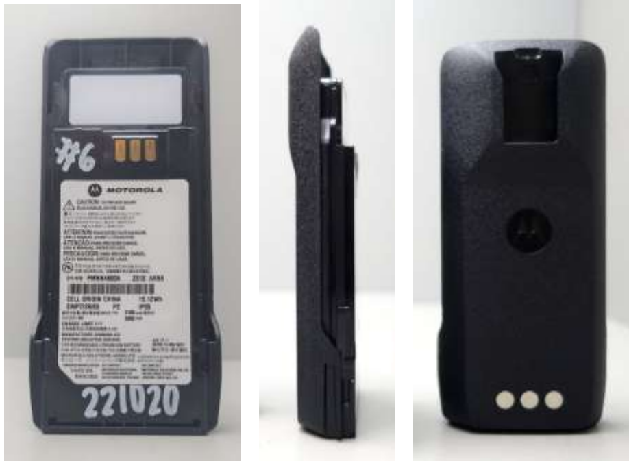
PMNN4600A: Front View, Side View and Back View