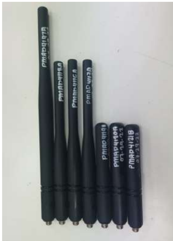
Left to Right: PMAD4147A, PMAD4118A, PMAD4116A, PMAD4117A, PMAD4119A, PMAD4120A, PMAD4121B