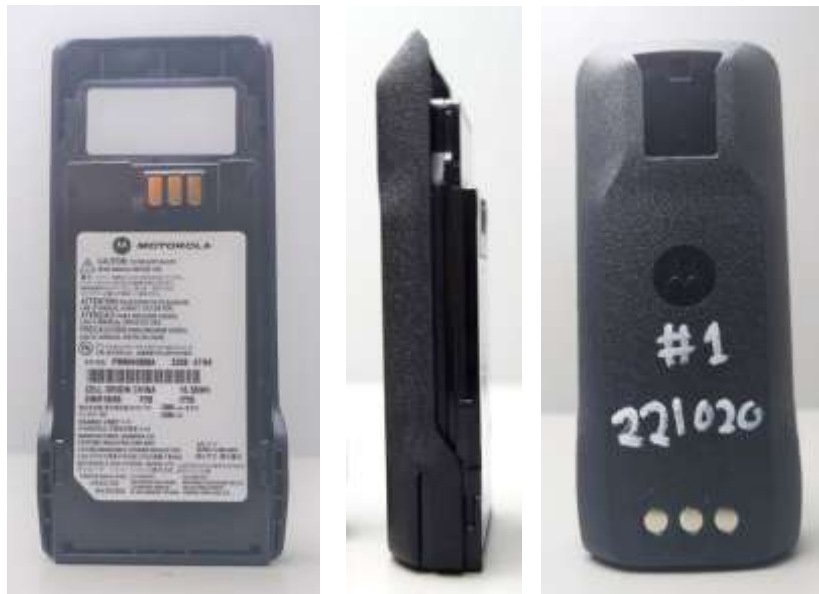
PMNN4598A: Front View, Side View and Back View