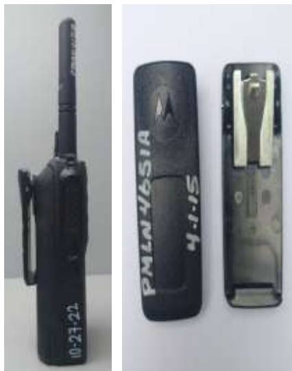
PMLN4651A Belt Clip