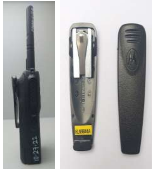
HLN9844A Belt Clip