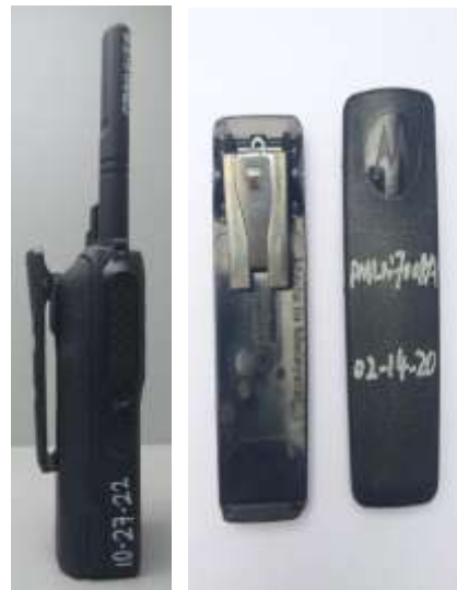
PMLN7008A Belt Clip