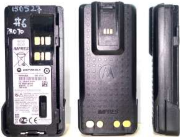
PMNN4488A Front, Back, and Side View