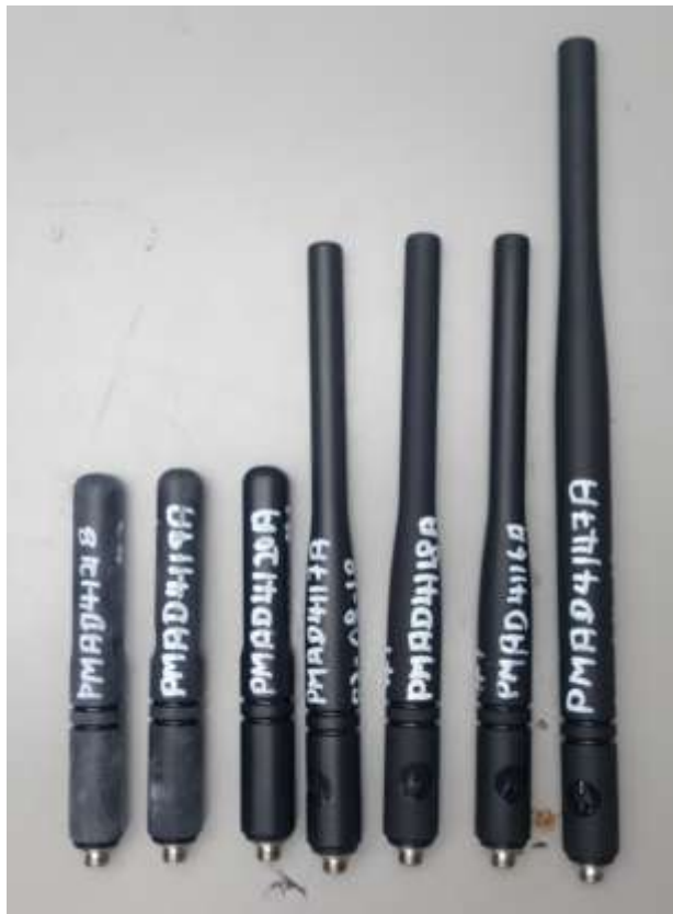
Left to Right: PMAD4121B, PMAD4119A, PMAD4120A, PMAD4117A, PMAD4118A, PMAD4116A, PMAD4147A

Note: only PMAD4116A, PMAD4117A & PMAD4118A were evaluated in the spot check