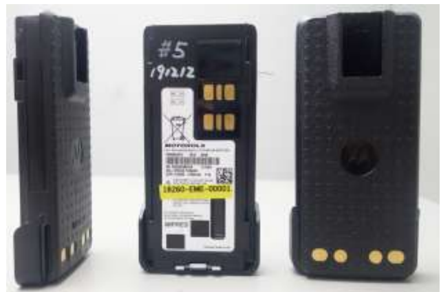
PMNN4491C (Front, side & back view)