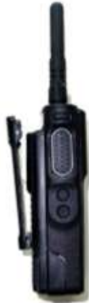
PMLN7296A Side view