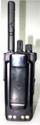
PMLN7296A Back view