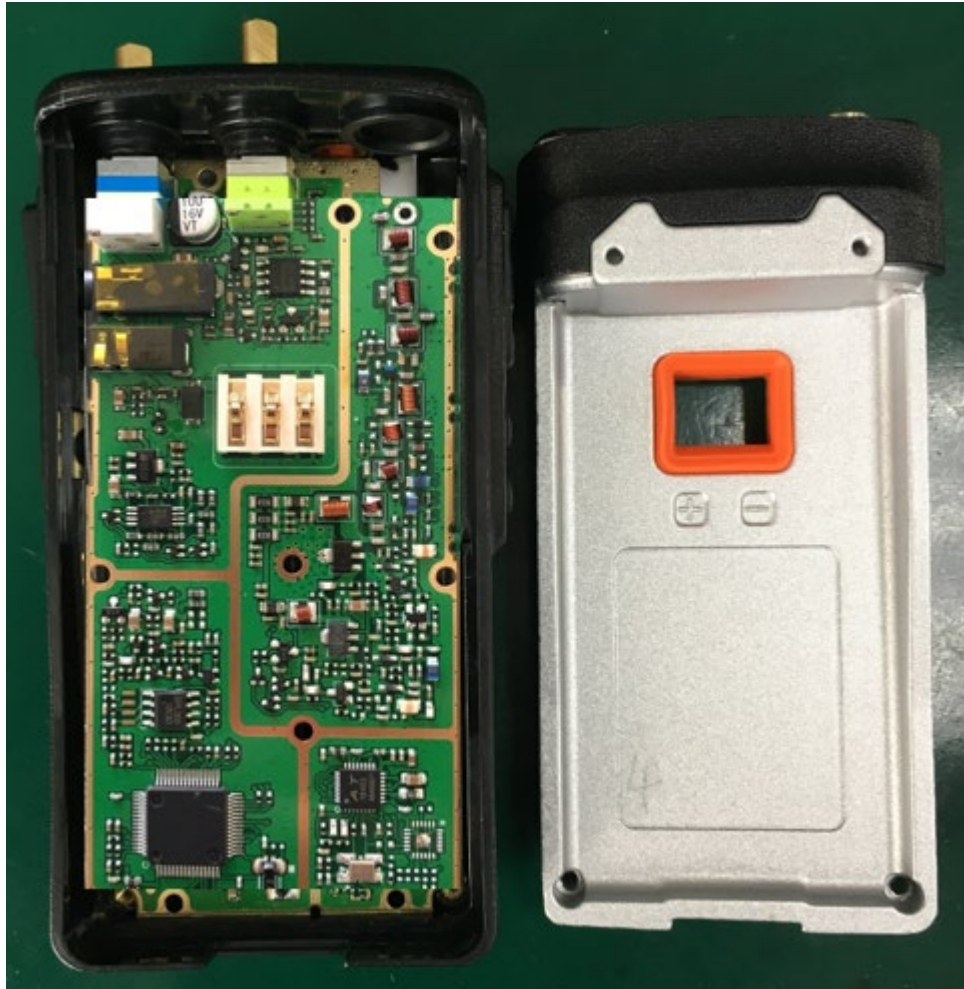
Chassis and housing (back side)