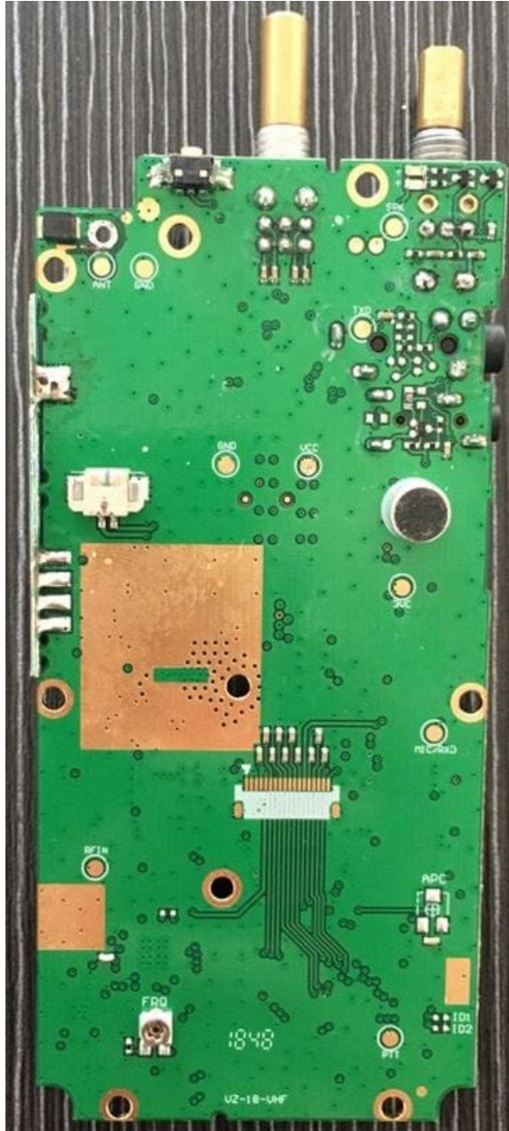
RF Board (Top)