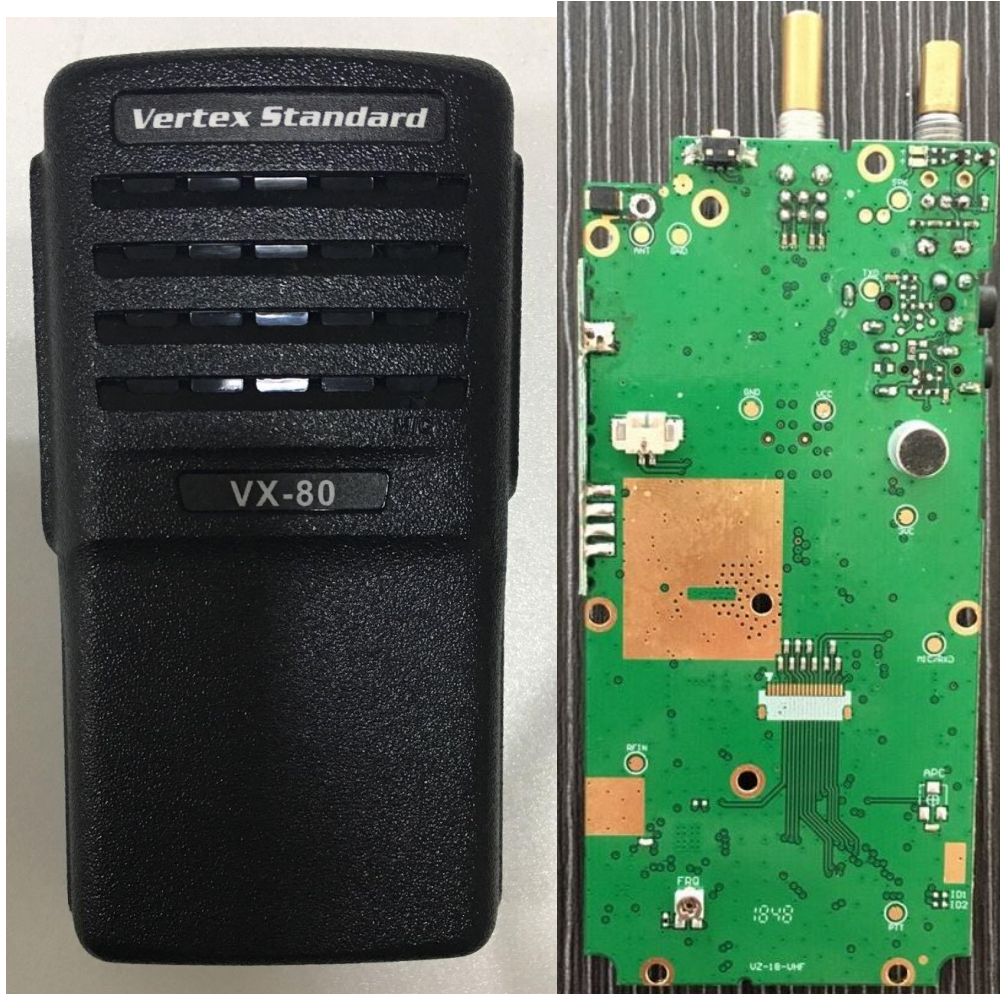
RF Board with Chassis and housing (front side)