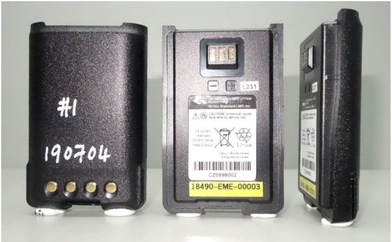
Back, Front and Side View: CZ089B002