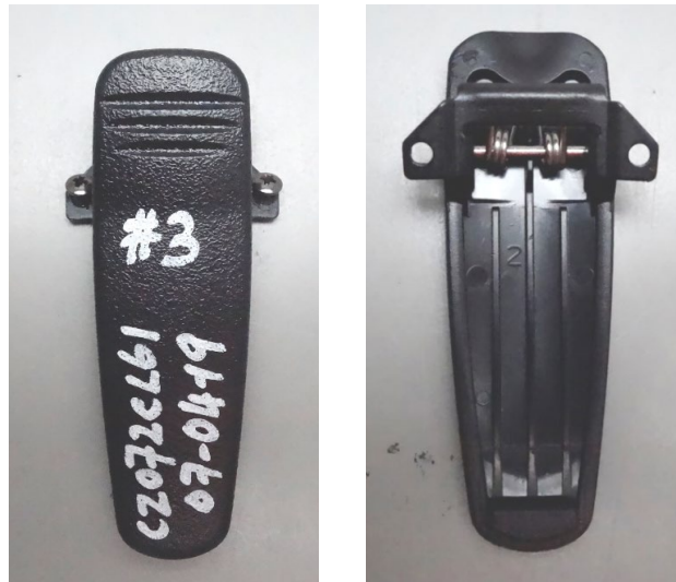
Belt Clip Front and Back View CZ072CL61