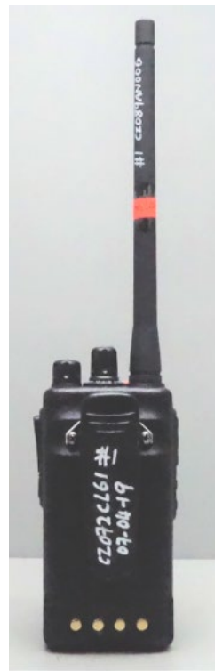
DUT Back View Belt Clip CZ072CL61