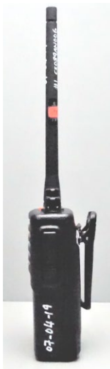
DUT Side View Belt Clip CZ072CL61