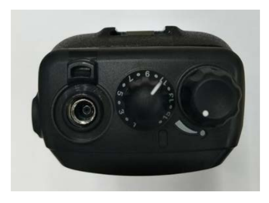
Top View (without Antenna) (AAH01JDC9JC2AN / AAH01JDC9JA2AN)