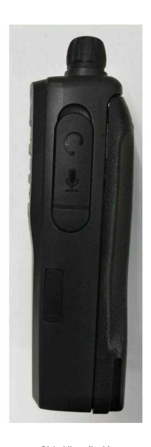
Side View (Left) (AAH01JDC9JC2AN / AAH01JDC9JA2AN)