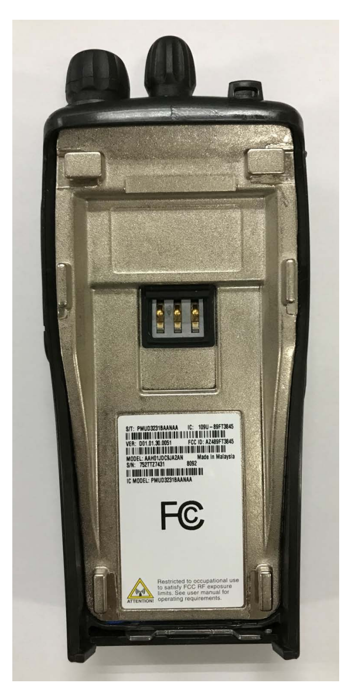
Back View (FCC/IC label) (AAH01JDC9JC2AN / AAH01JDC9JA2AN)