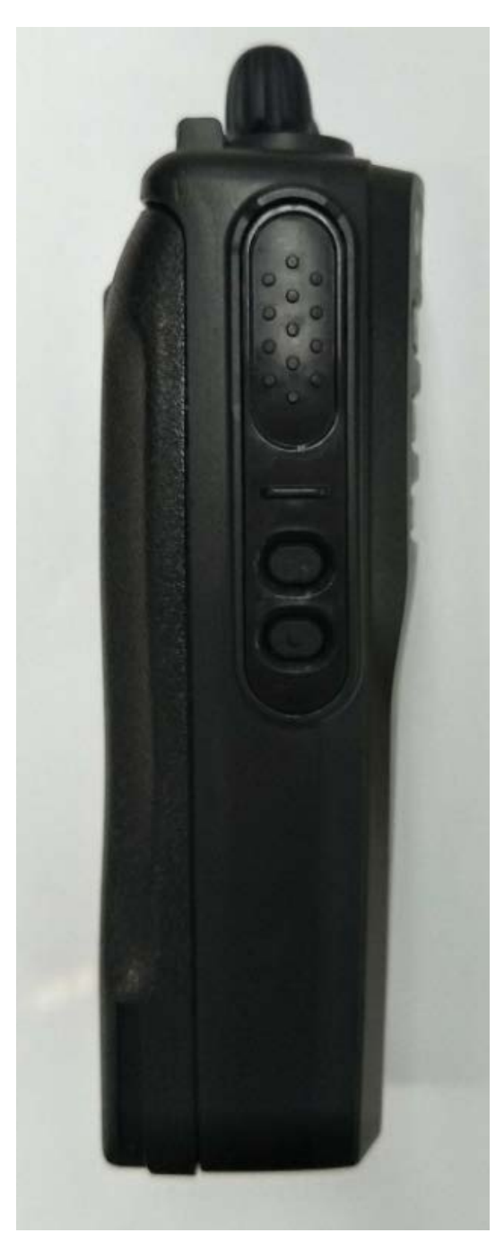
Side View (Right) (AAH01JDC9JC2AN / AAH01JDC9JA2AN)