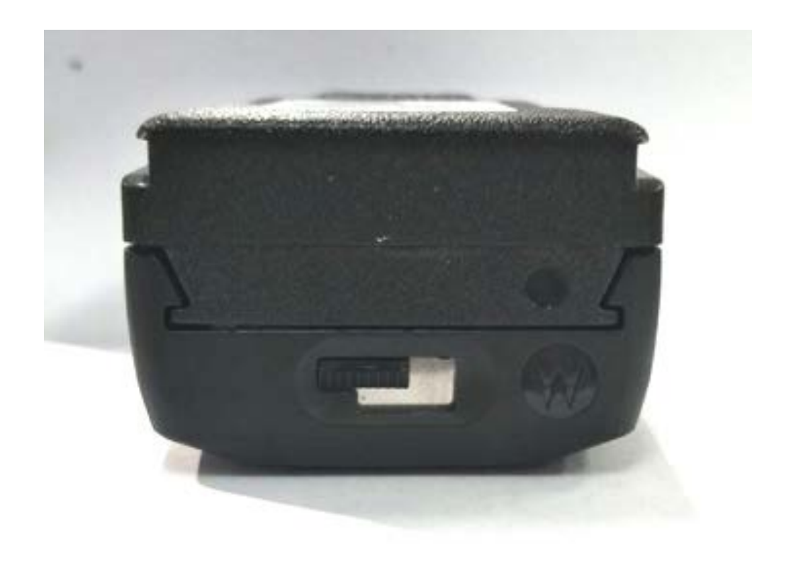
Exhibit 3G – Bottom View with Battery

Bottom View with Battery (AAH01JDC9JC2AN / AAH01JDC9JA2AN)