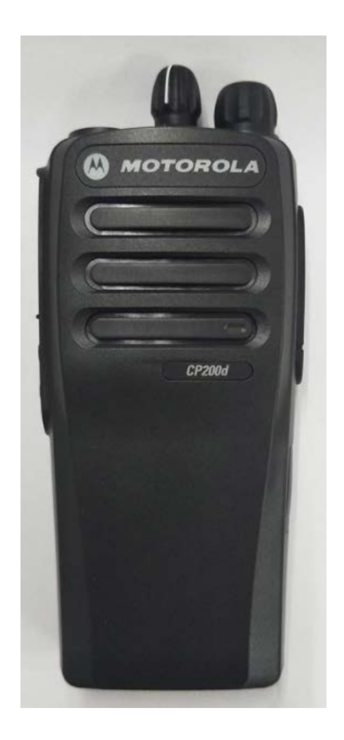
Front view of Radio (AAH01JDC9JC2AN / AAH01JDC9JA2AN)