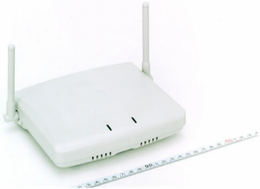
Front View of the SN992CSEO