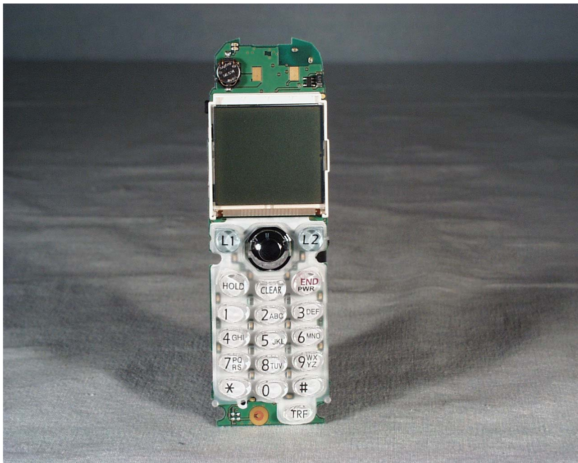
Photograph 1 shows the keyboard and display.