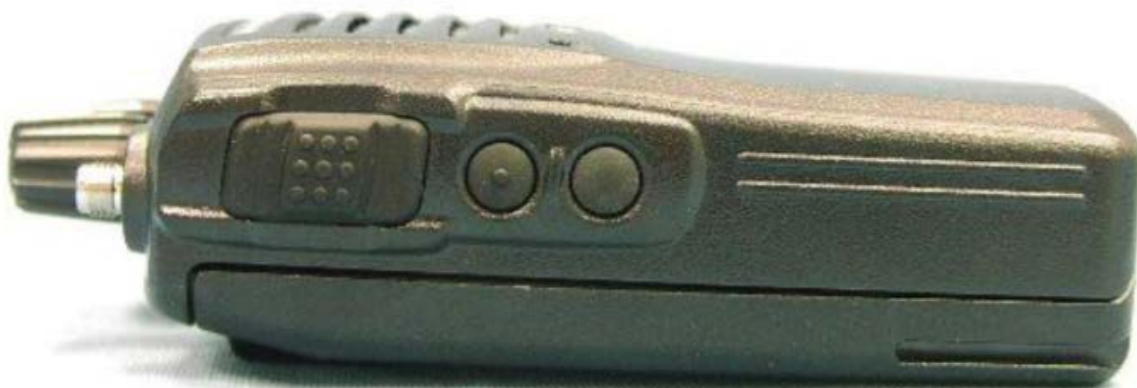
SIDE VIEW (LEFT) – VERTEX EVX-261-D0-5 FCC ID: AXI11373020 / IC: 10239A-11373020