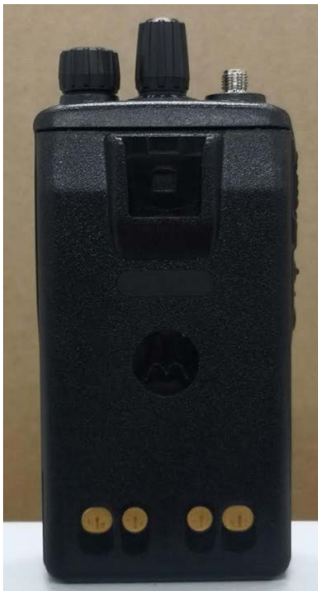
BACK VIEW WITH BATTERY – MOTOROLA EVX-261-D0-5 FCC ID: AXI11373020/ IC: 109U-89FT3839