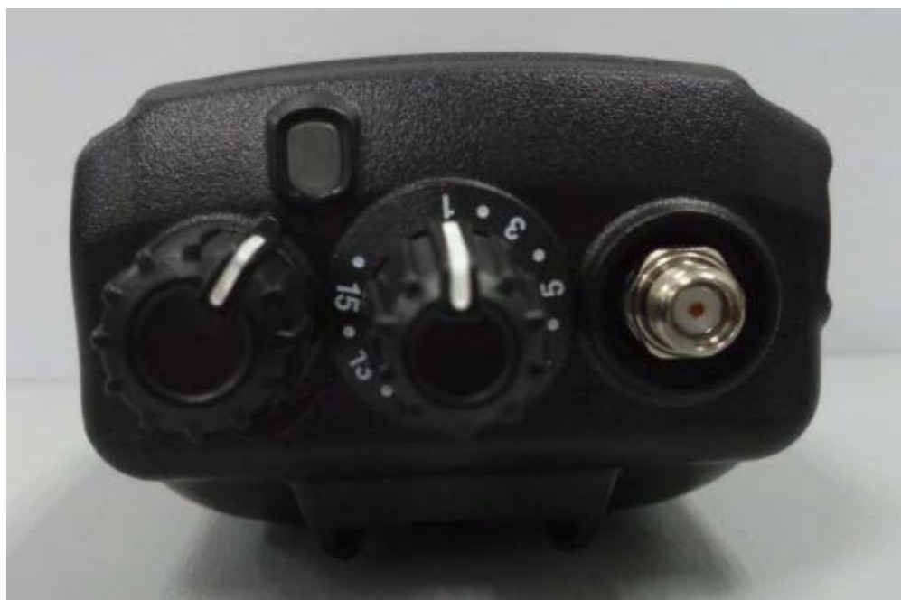
TOP VIEW – MOTOROLA EVX-261-D0-5 FCC ID: AXI11373020/ IC: 109U-89FT3839