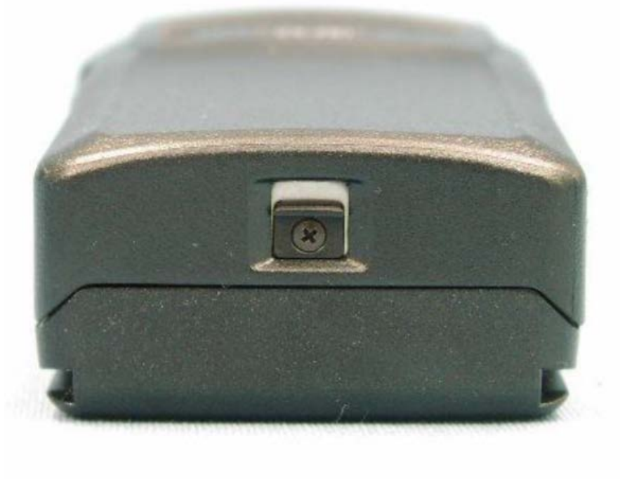
BOTTOM VIEW - VERTEX EVX-261-D0-5 FCC ID: AXI11373020 / IC: 10239A-11373020