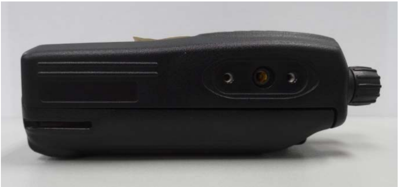
SIDE VIEW (RIGHT) MOTOROLA EVX-261-D0-5 FCC ID: AXI11373020/ IC: 109U-89FT3839