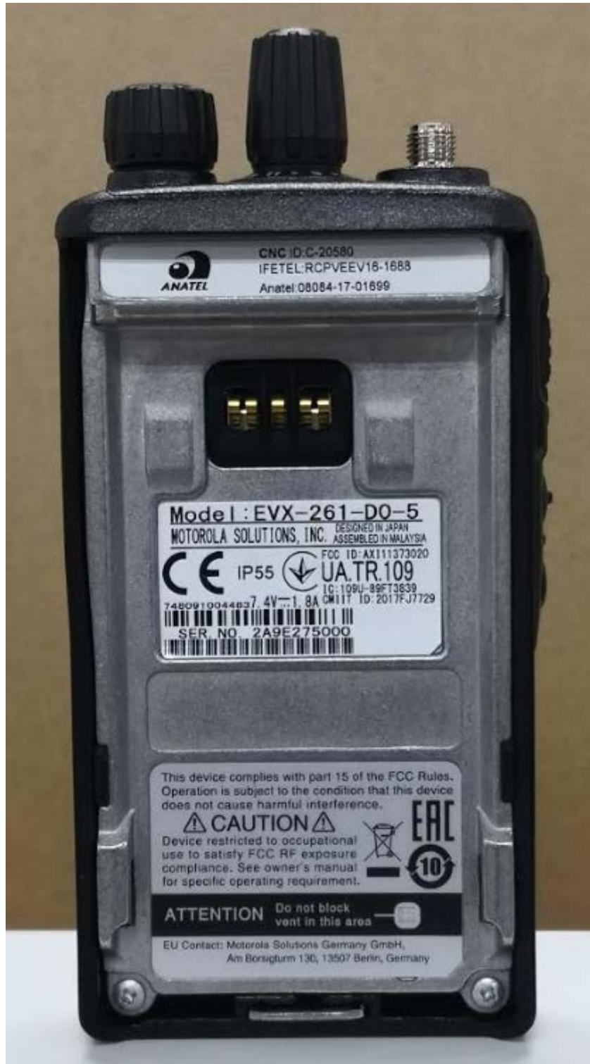
BACK VIEW - MOTOROLA EVX-261-D0-5 - NEW FCC ID: AXI11373020/ IC: 109U-89FT3839