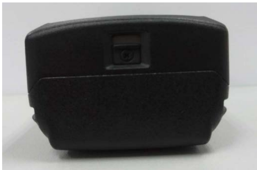
BOTTOM VIEW – MOTOROLA EVX-261-D0-5 FCC ID: AXI11373020/ IC: 109U-89FT3839