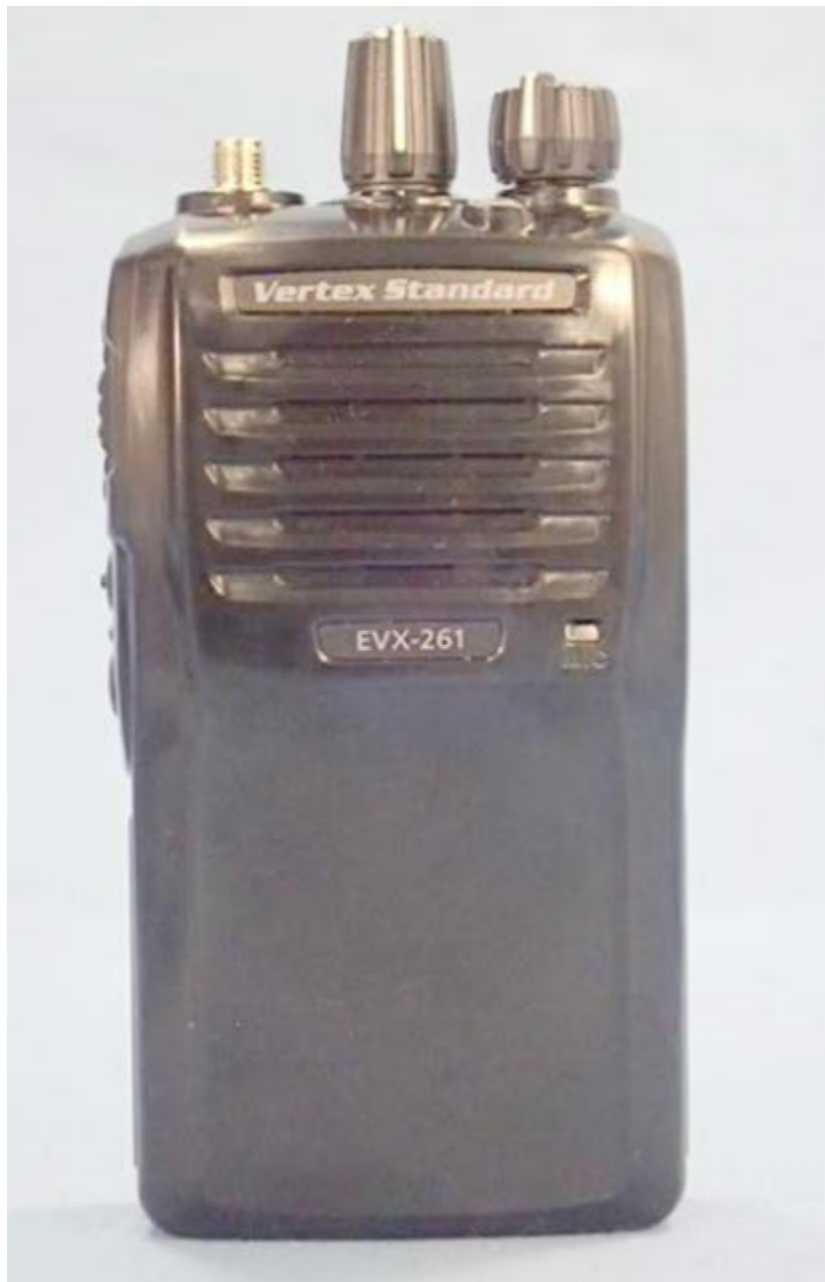
FRONT VIEW VERTEX EVX-261-D0-5 FCC ID: AXI11373020 / IC: 10239A-11373020