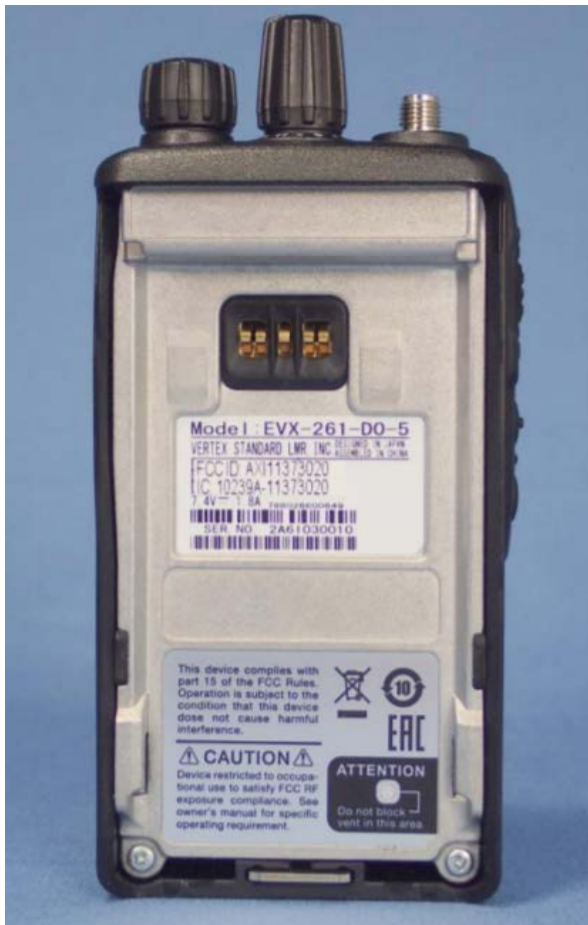
BACK VIEW – VERTEX EVX-261-D0-5 FCC ID: AXI11373020 / IC: 10239A-11373020