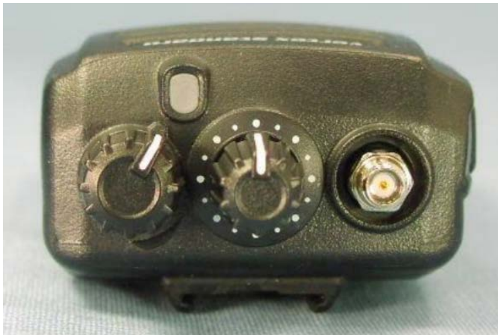
TOP VIEW – VERTEX EVX-261-D0-5 FCC ID: AXI11373020 / IC: 10239A-11373020