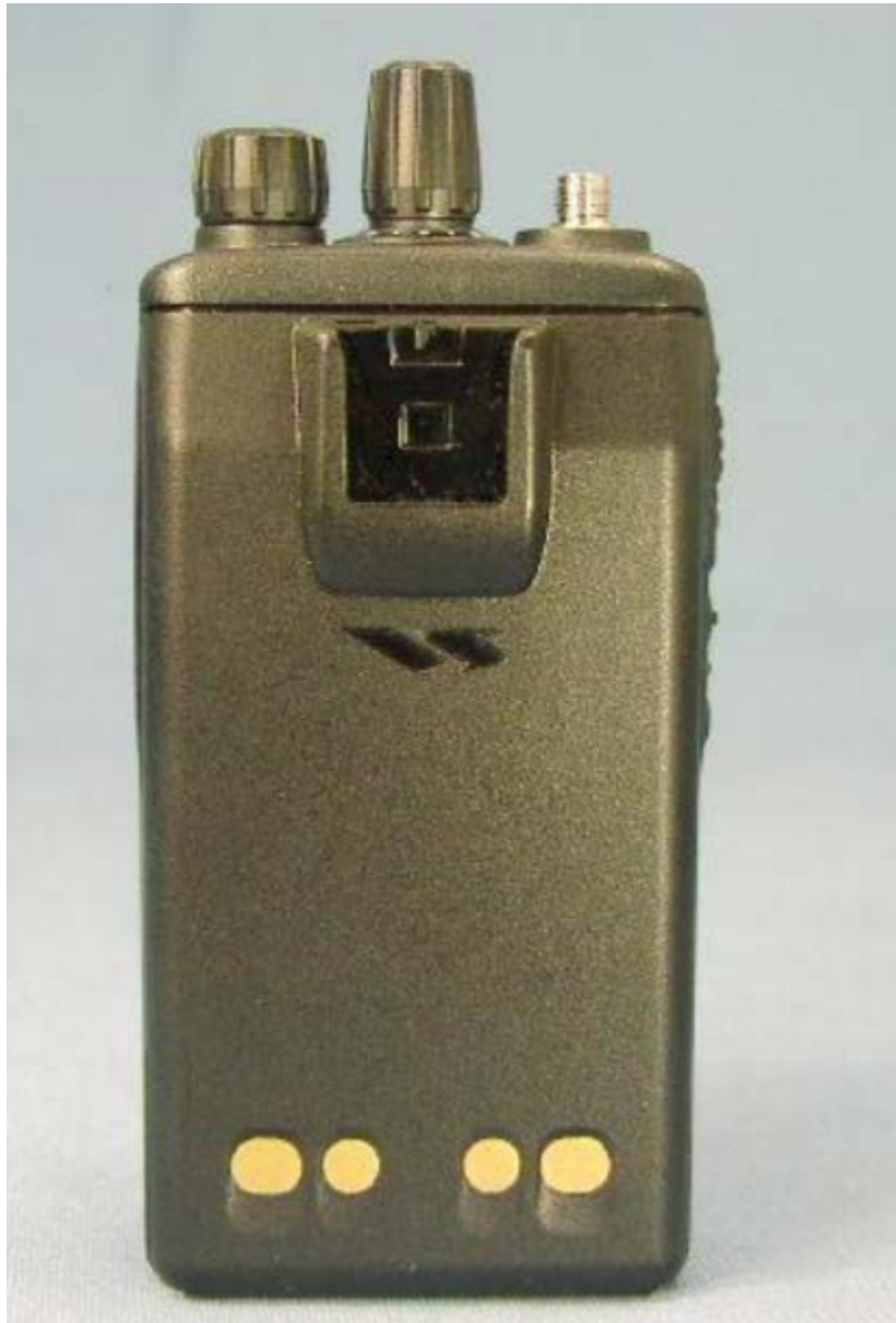
BACK VIEW WITH BATTERY- VERTEX EVX-261-D0-5 FCC ID: AXI11373020 / IC: 10239A-11373020