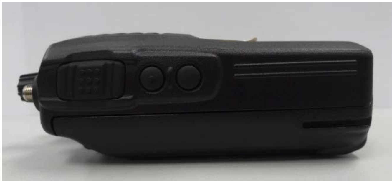
SIDE VIEW (LEFT) – MOTOROLA EVX-261-D0-5 FCC ID: AXI11373020/ IC: 109U-89FT3839