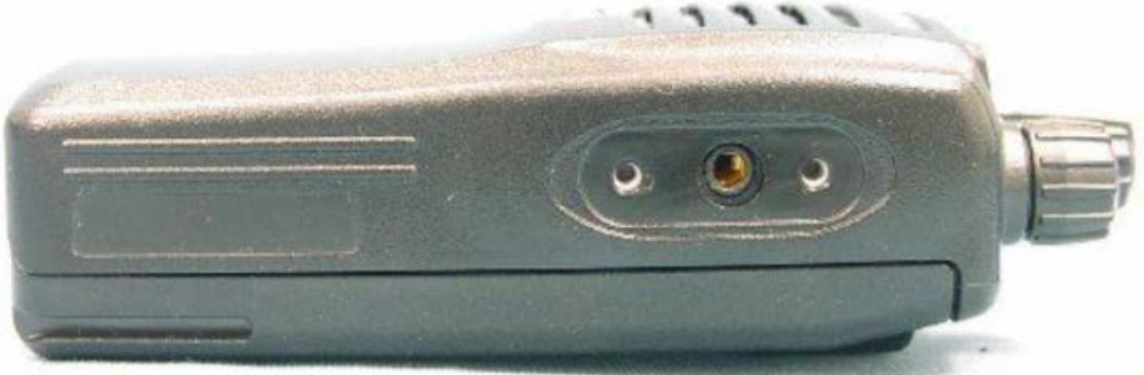
SIDE VIEW (RIGHT) VERTEX EVX-261-D0-5 FCC ID: AXI11373020 / IC: 10239A-11373020