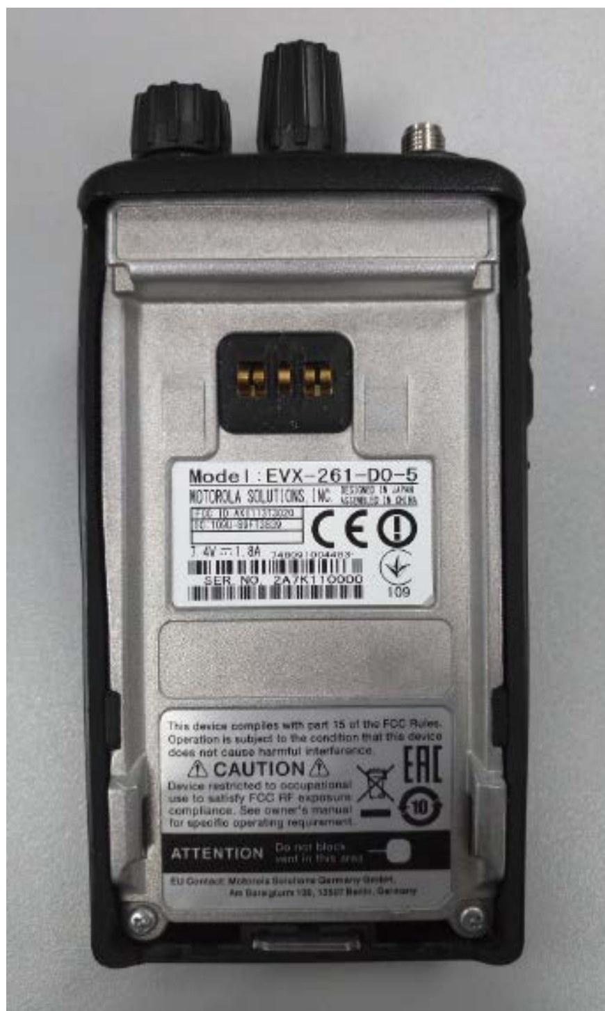
BACK VIEW – MOTOROLA EVX-261-D0-5 - OLD FCC ID: AXI11373020/ IC: 109U-89FT3839