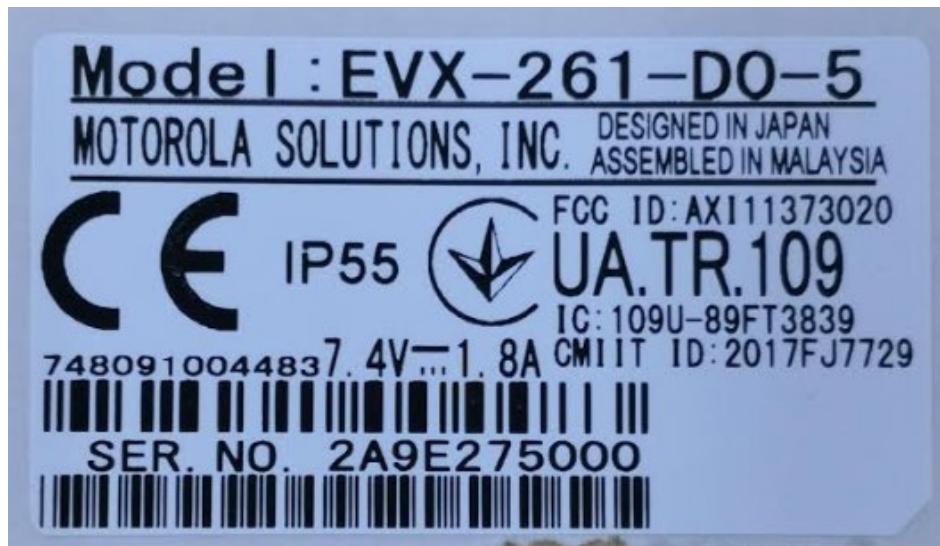
MOTOROLA FCC/IC Label for EVX-261-D0-5 - NEW