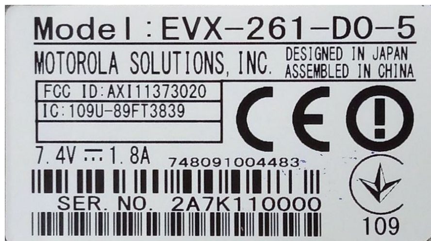
MOTOROLA FCC/IC Label for EVX-261-D0-5 - OLD

PART 2 (MOTOROLA FCC/IC Label) FCC ID : AXI11373020 IC : 109U-89FT3839