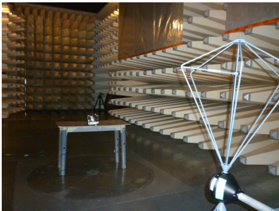
Set-up for Radiated Emission (Transceiver)