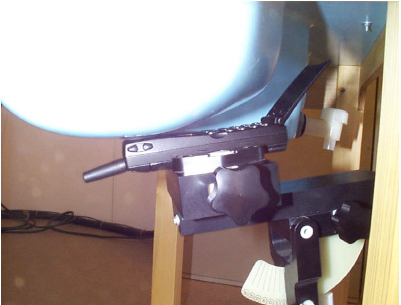
Ericsson CF888 on The Right Side of Phantom