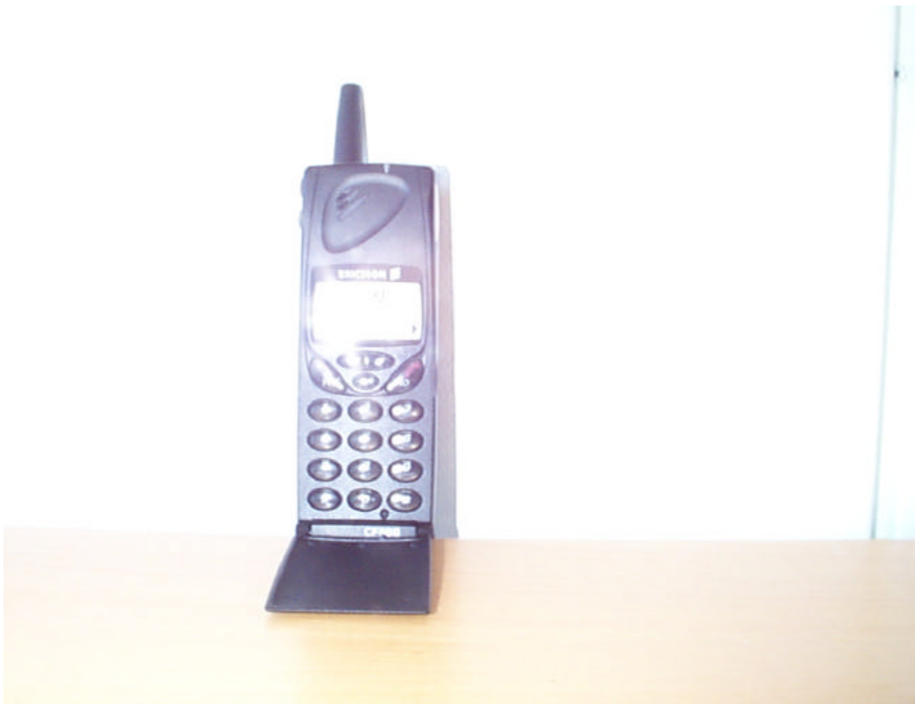
Ericsson CF888 Front Side