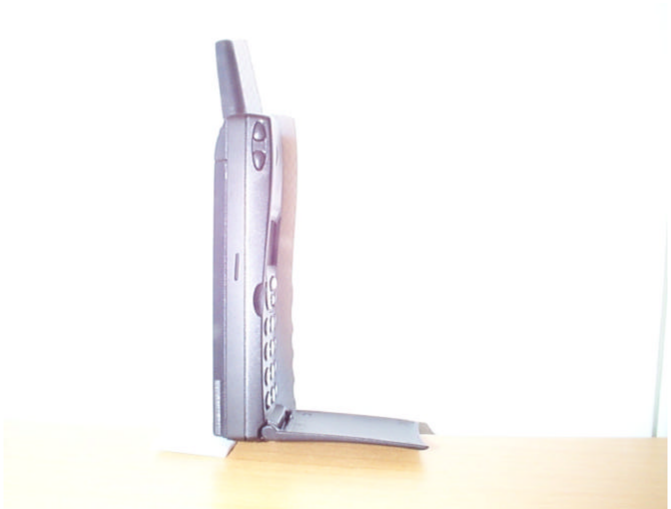
Ericsson CF888 Right Side