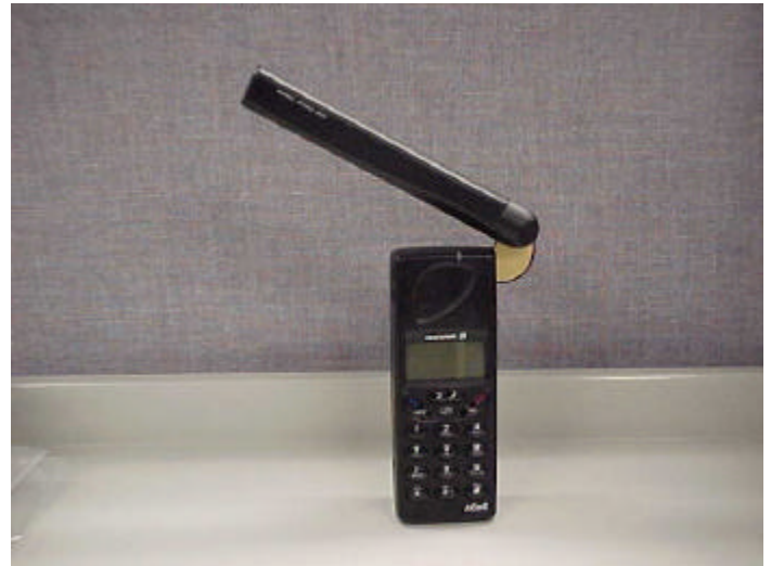
Front view of device for the four user positions of the antenna, (a) the stowed position, (b) the left-hand user position, (c) the 180° position, and (d) the right-hand user position.