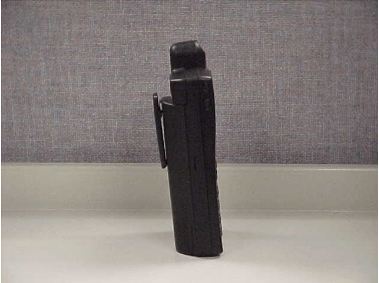
Side view of device (antenna in stowed position).