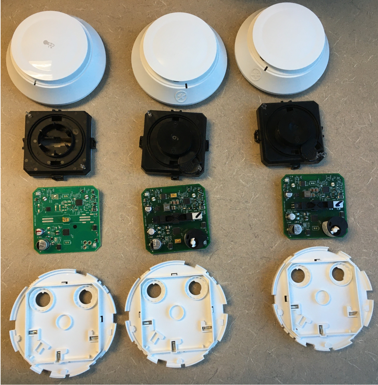
Self Test Detector Assembly (L->R Heat, Photo/Heat, Photo):