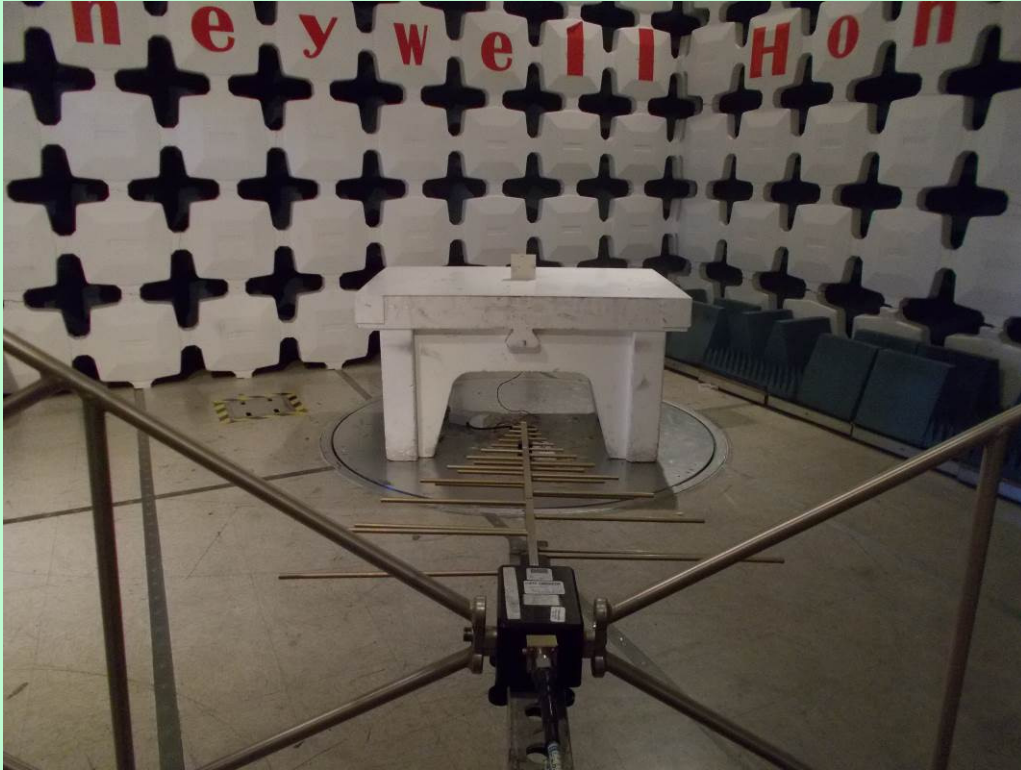
Radiated Emission Setup –30 MHz to 1 GHz [Horizontal polarization Polarization]