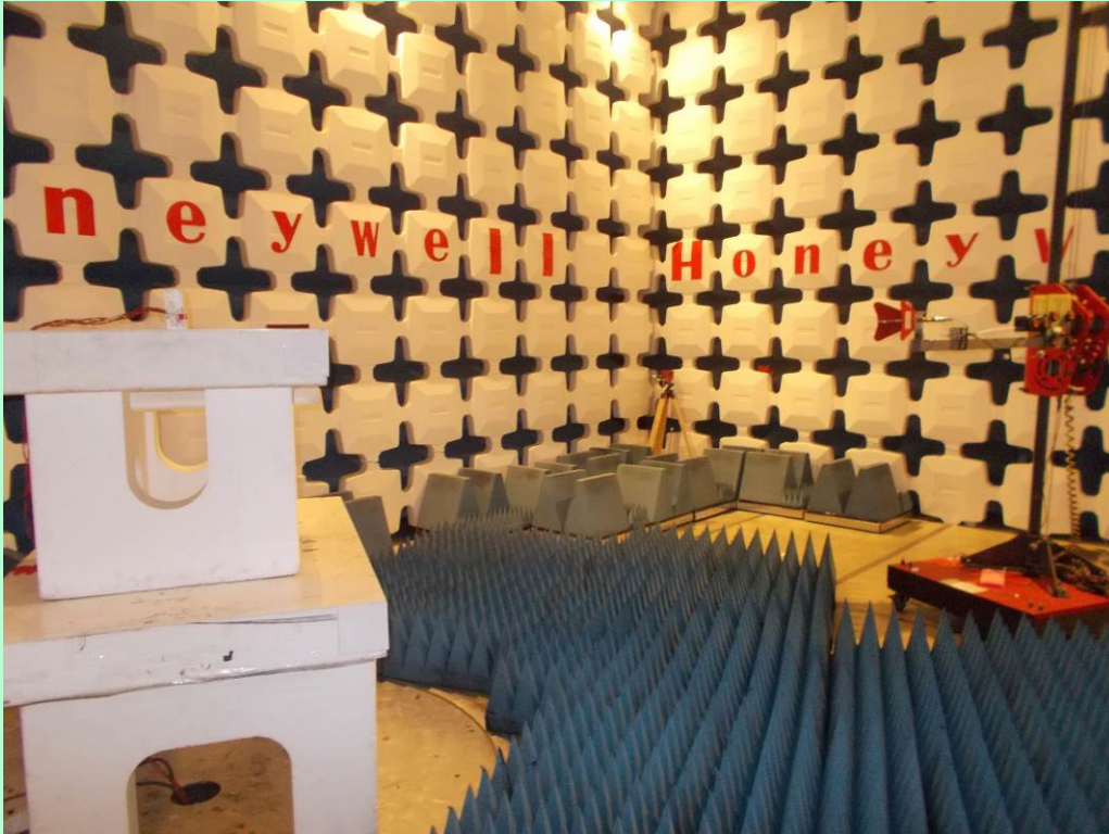
Radiated Emission Setup –1 GHz to 10 GHz [Horizontal Polarization]