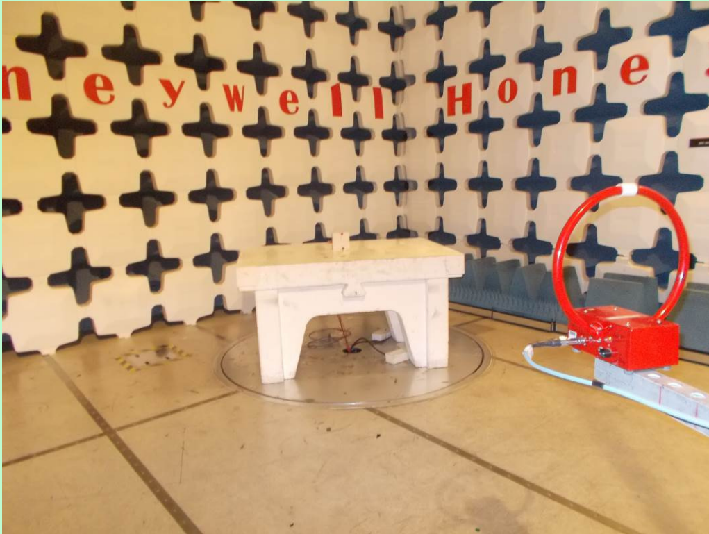
Radiated Emission Setup – 9 KHz to 30 MHz [Parallel]