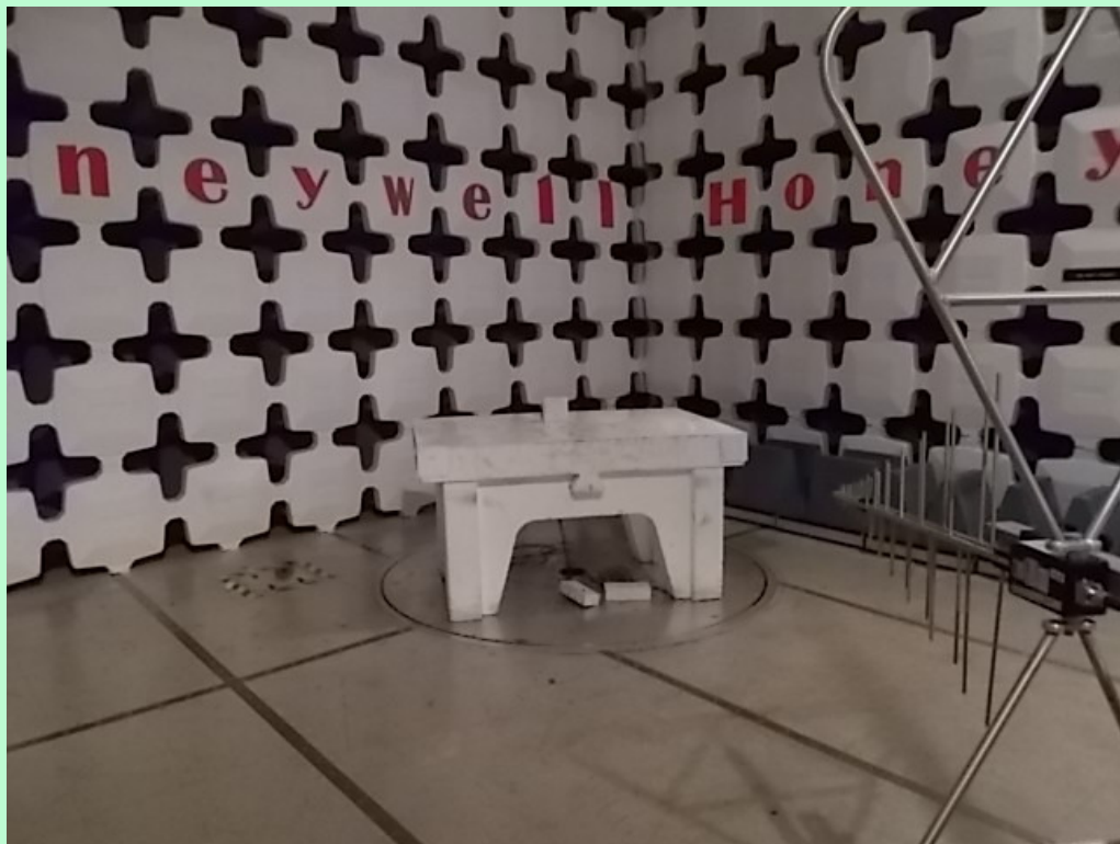
Radiated Emission Setup –30 MHz to 1 GHz [Vertical Polarization]