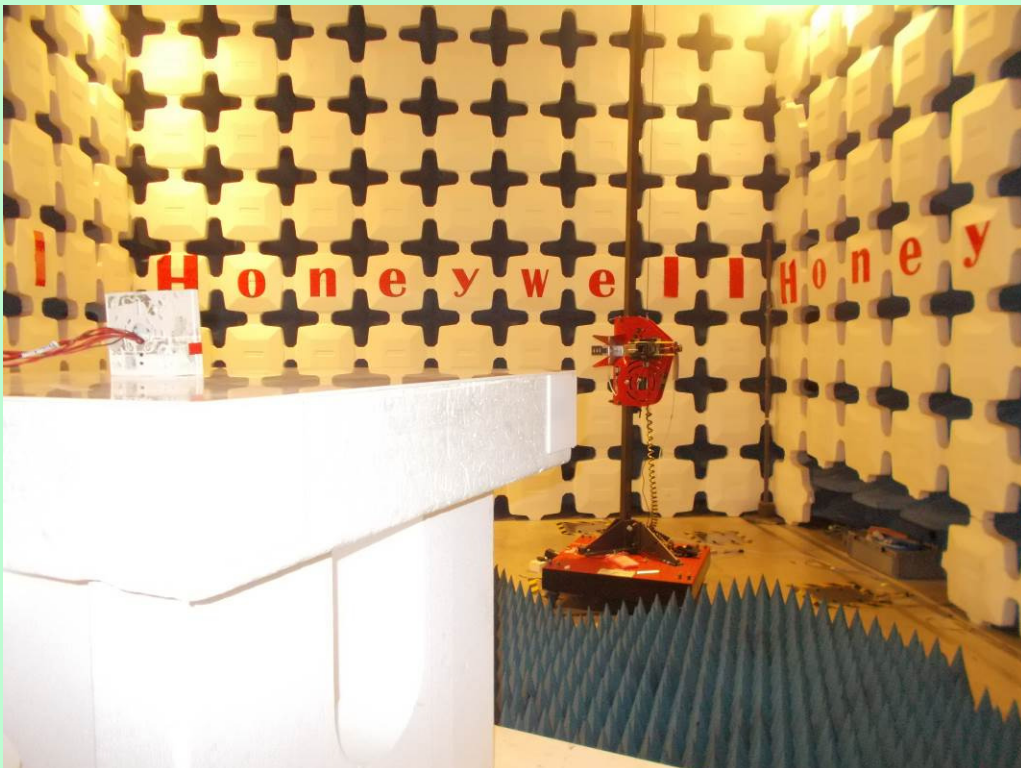
Radiated Emission Setup –1 GHz to 10 GHz [Vertical Polarization]