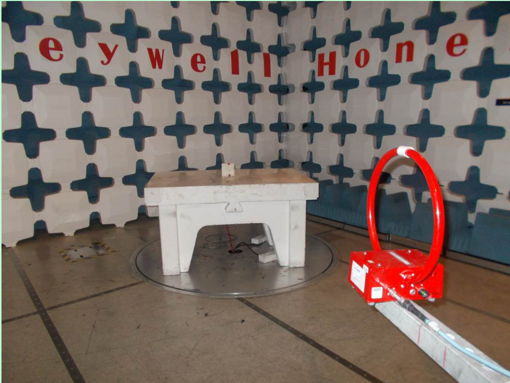
Radiated Emission Setup – 9 KHz to 30 MHz [Perpendicular]