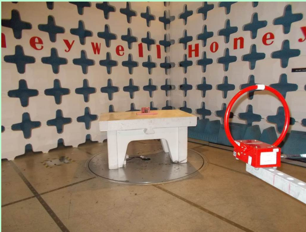
Radiated Emission Setup – 9 KHz to 30 MHz [Parallel]