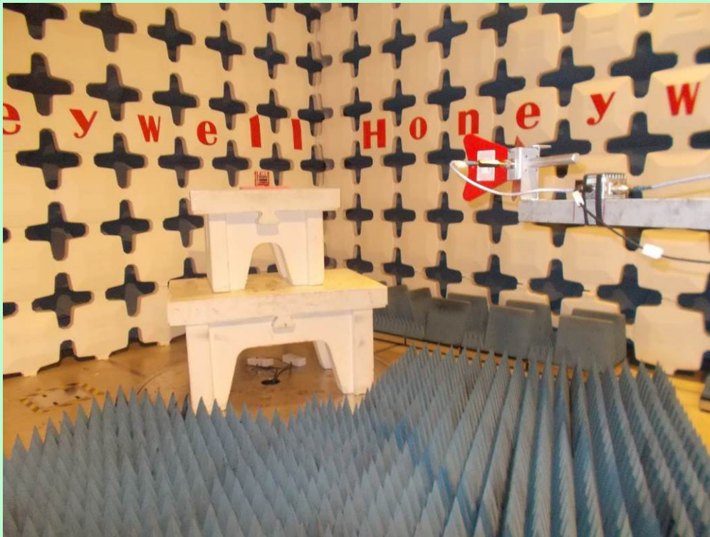
Radiated Emission Setup -1 GHz to 10 GHz [Horizontal Polarization]