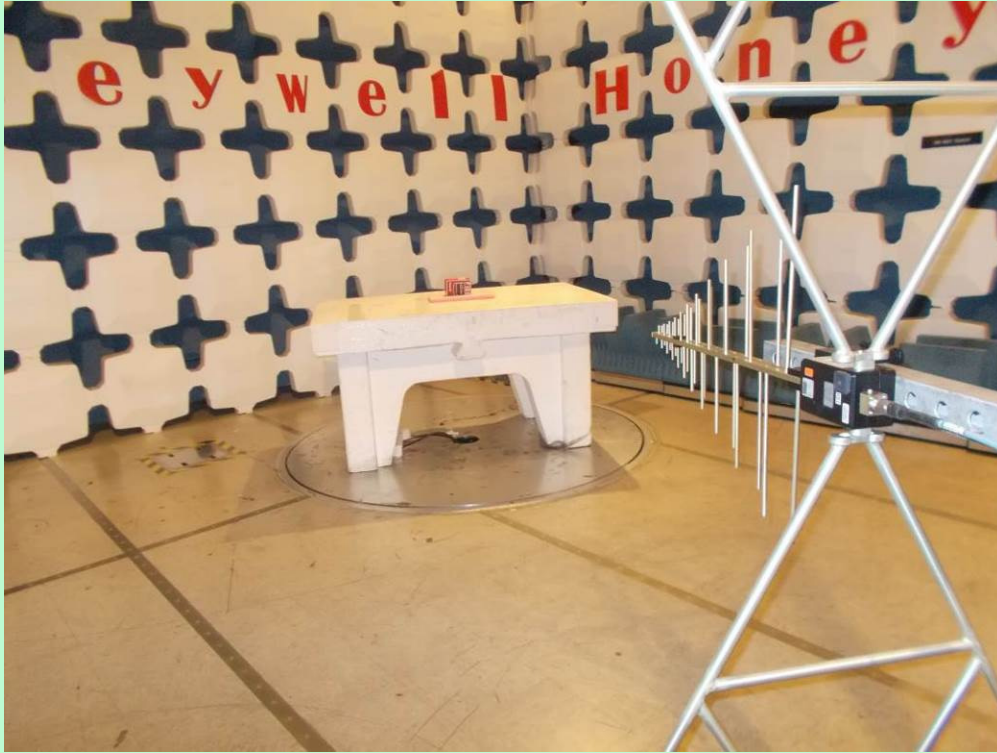
Radiated Emission Setup -30 MHz to 1 GHz [Vertical Polarization]