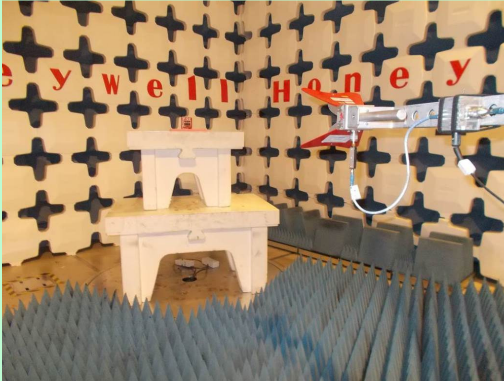
Radiated Emission Setup –1 GHz to 10 GHz [Vertical Polarization]