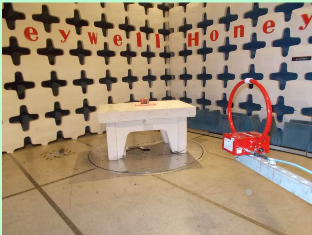
Radiated Emission Setup – 9 KHz to 30 MHz [Perpendicular]