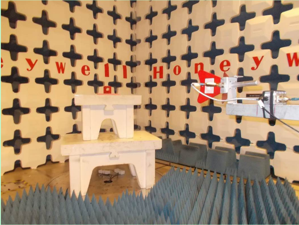
Radiated Emission Setup –1 GHz to 10 GHz [Horizontal Polarization]