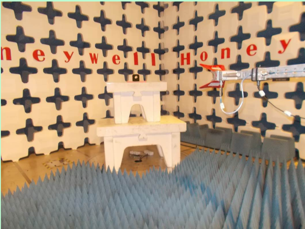
Radiated Emission Setup –1 GHz to 10 GHz [Vertical Polarization]