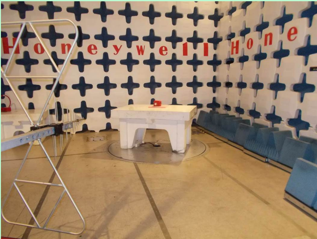
Radiated Emission Setup –30 MHz to 1 GHz [Vertical Polarization]