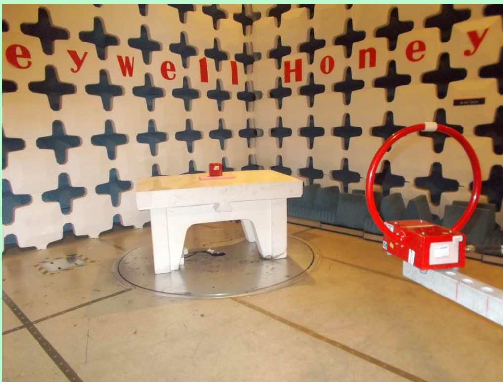
Radiated Emission Setup – 9 KHz to 30 MHz [Parallel]