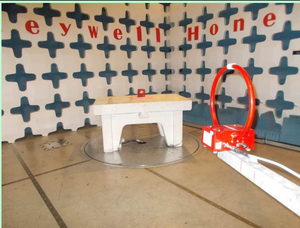
Radiated Emission Setup – 9 KHz to 30 MHz [Perpendicular]