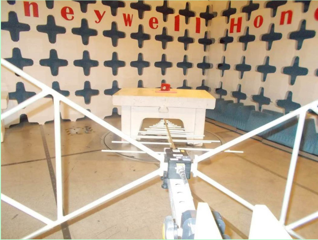
Radiated Emission Setup –30 MHz to 1 GHz [Horizontal polarization Polarization]