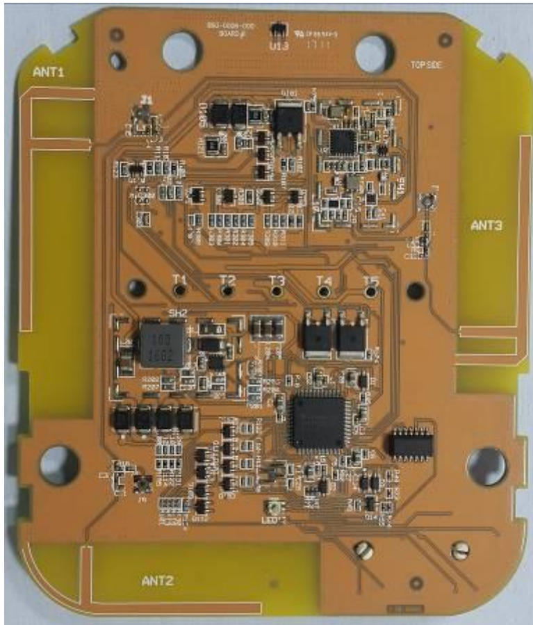
PCB – Top View