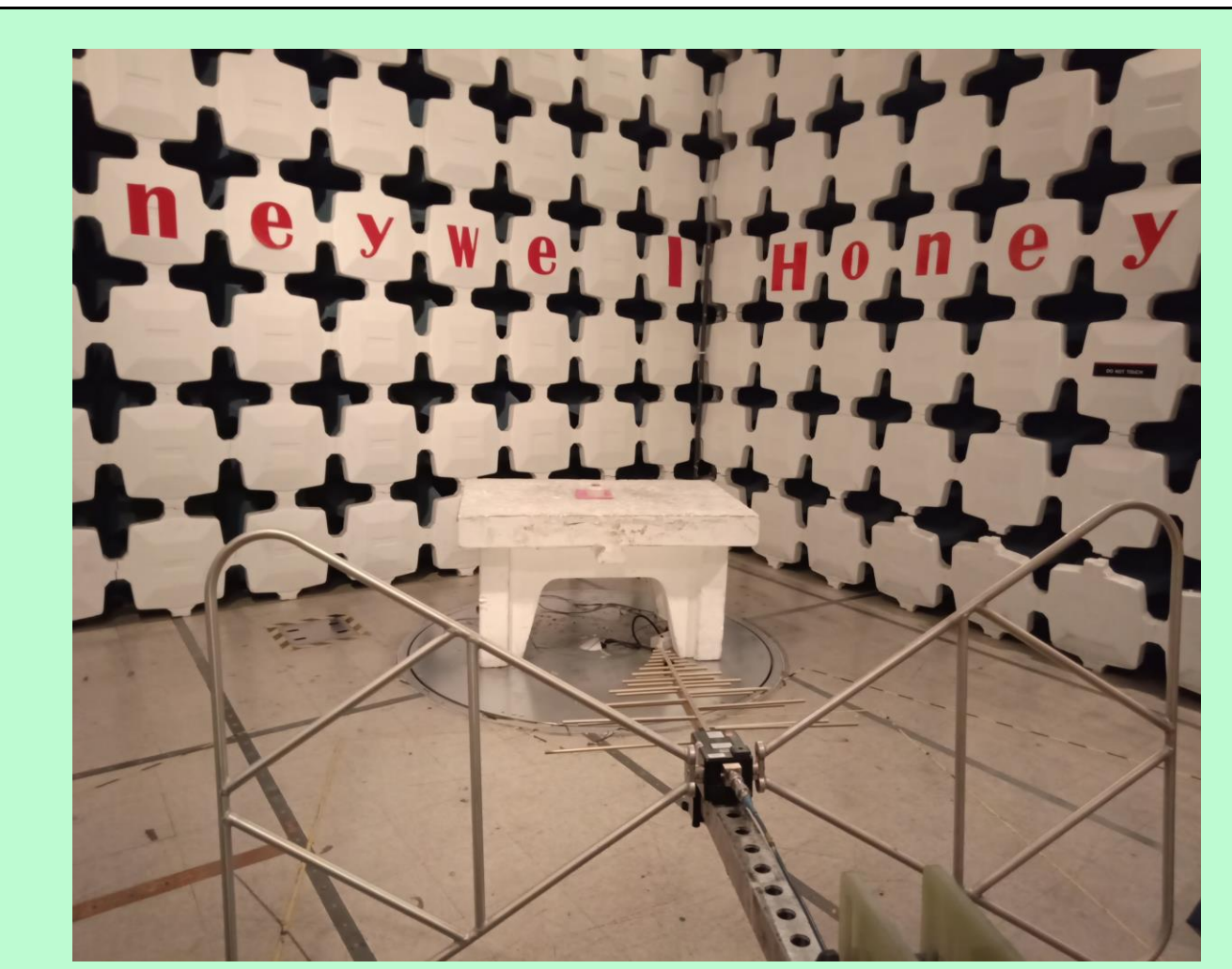
Radiated Emission Setup -30 MHz to 1 GHz [ Horizontal Polarization]