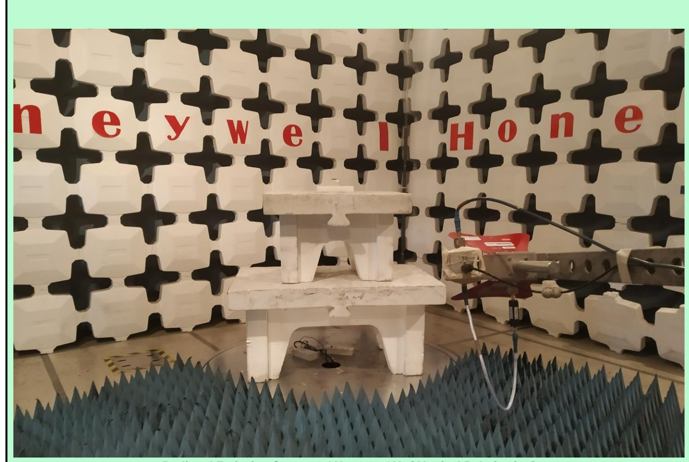
Radiated Emission Setup –1 GHz to 10 GHz [ Vertical Polarization]