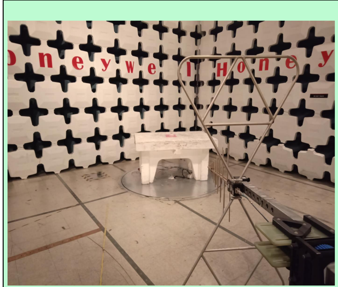
Radiated Emission Setup -30 MHz to 1 GHz [ Vertical Polarization]