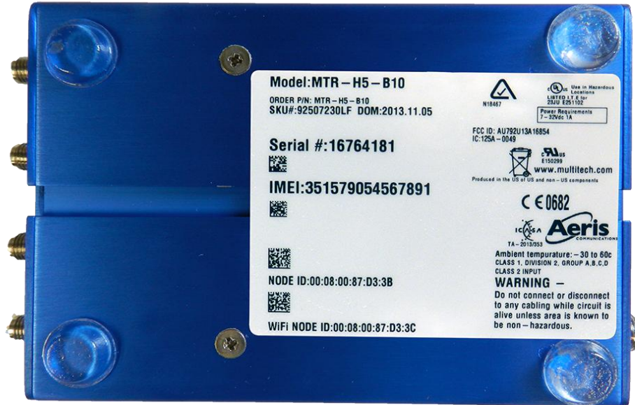
Figure (1) Label located on the bottom of the device