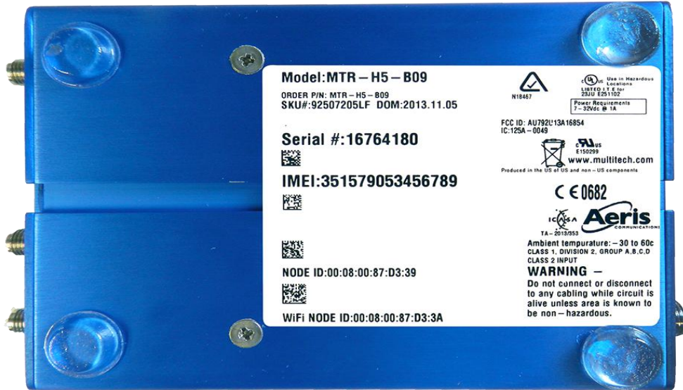
Figure (1) label located on the bottom of the device