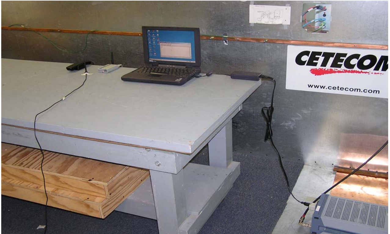
AC POWER LINE CONDUCTED EMISSIONS (FRONT)