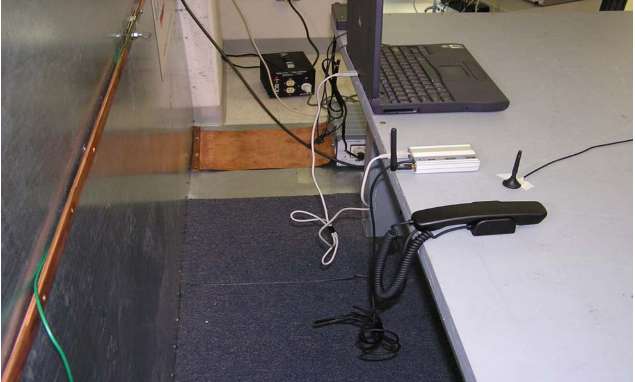
AC POWER LINE CONDUCTED EMISSIONS (BACK)