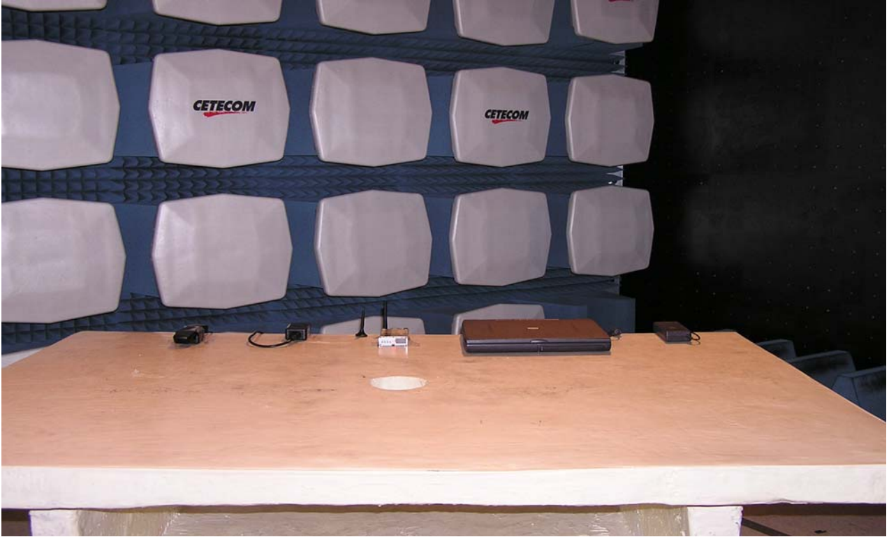
RADIATED EMISSIONS BELOW 1GHz (FRONT)