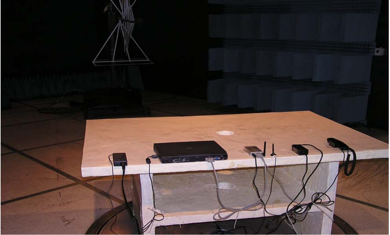
RADIATED EMISSIONS BELOW 1GHz (BACK)