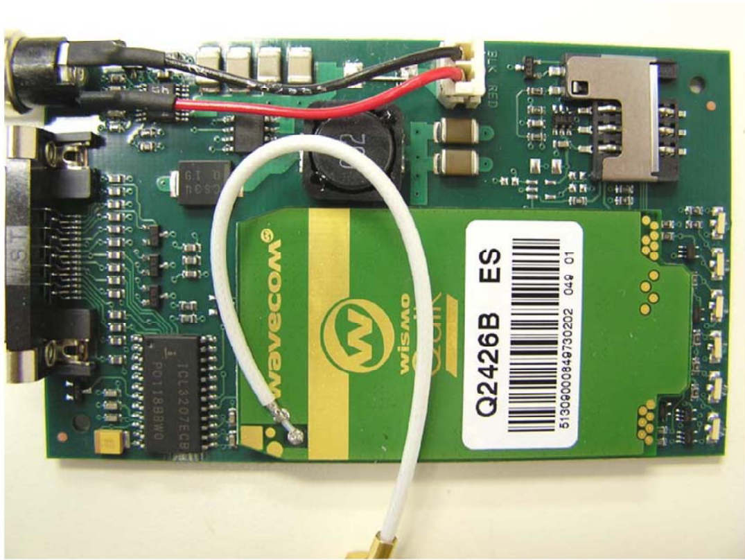
PCB – Top view