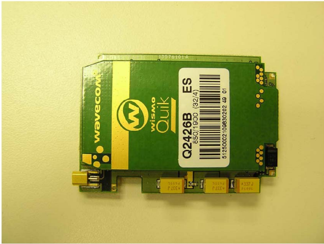
PCB – Top view

Internal photos MTMMC-G-F2 (Modem module)