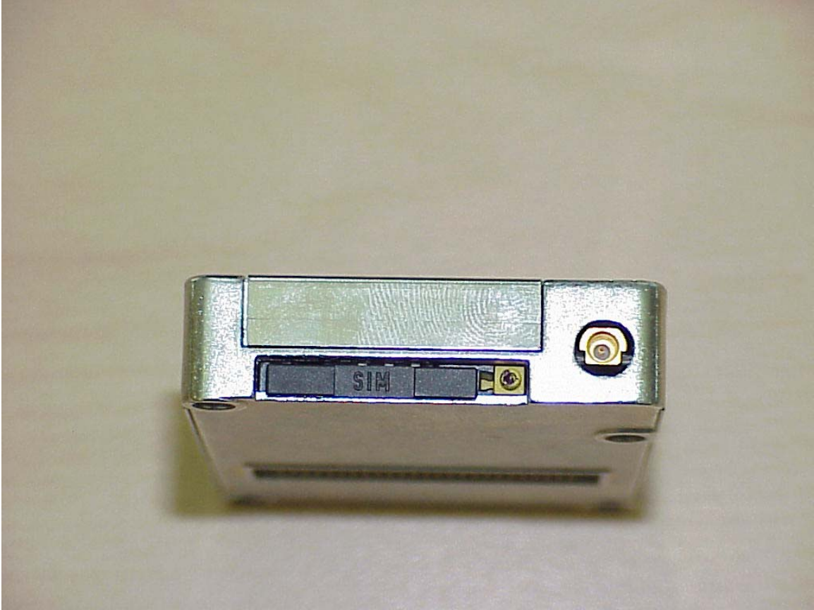
MTMMC-G-F2: profile view