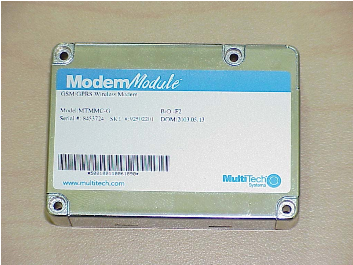
MTMMC-G-F2: Top view