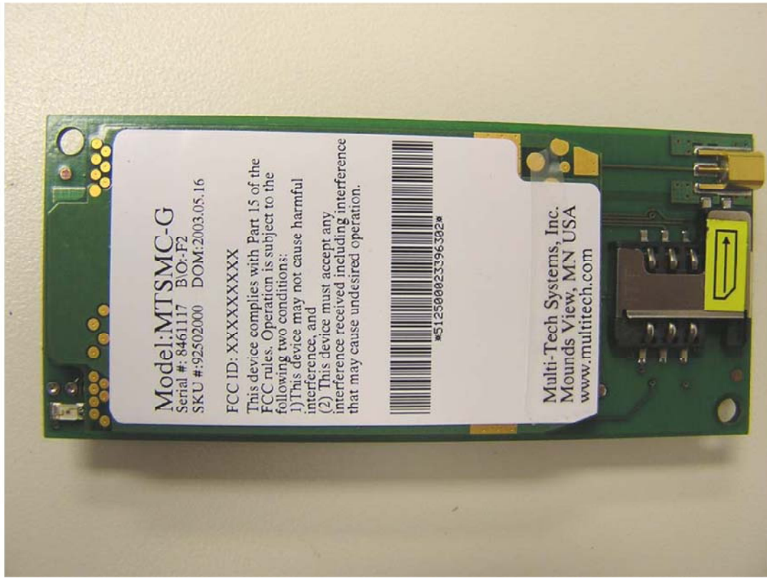
PCB – Top view