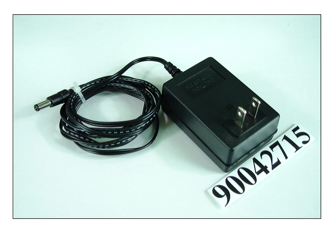
Report No.:RF90042715 Page 2 Issued: May 18, 2001