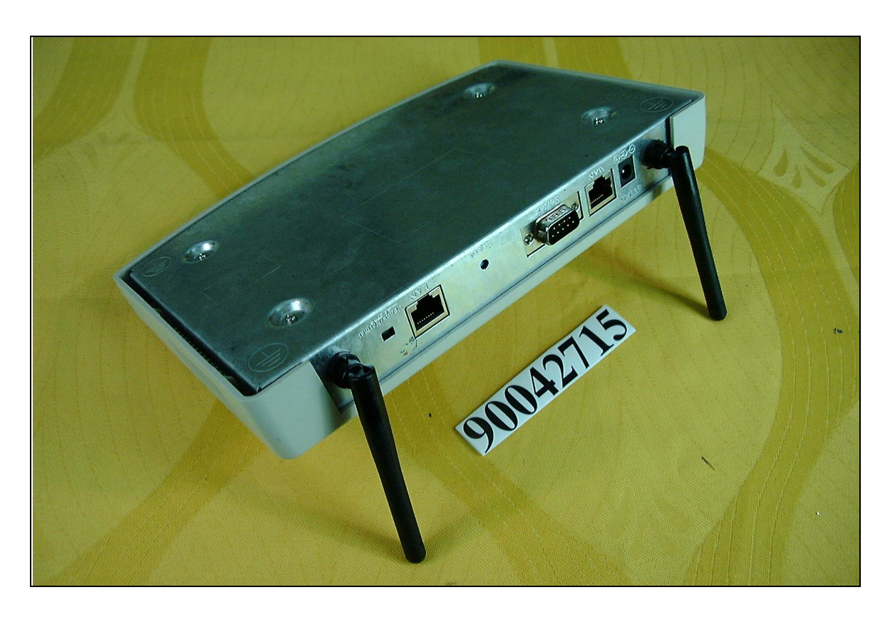
Report No.:RF90042715 Page 1 Issued: May 18, 2001