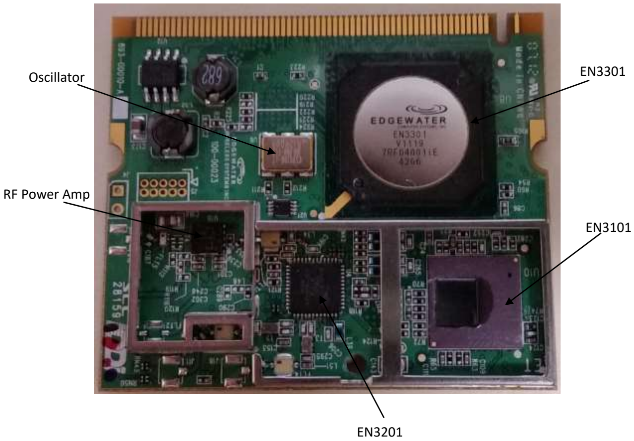
Figure 3 EWC24GWFR1 Top Side No Shield