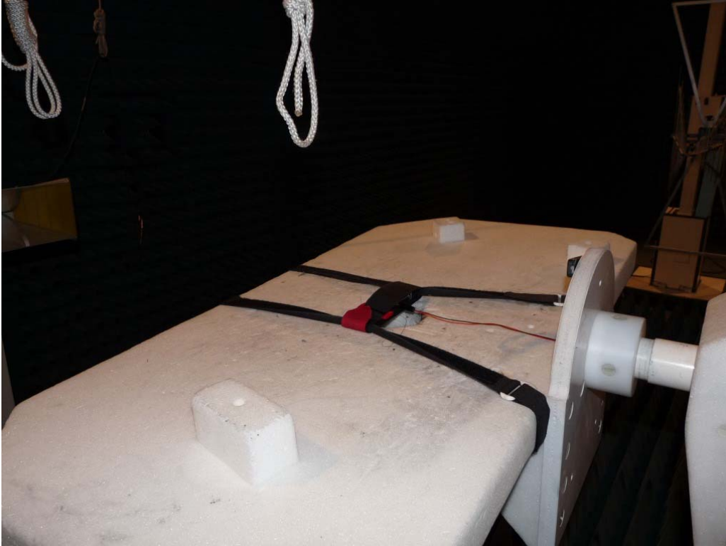
Photo 3: Test setup for radiated measurements (Enclosure, fully-anechoic chamber, 18-25 GHz, intentional radiator § 15)