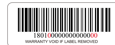
6. WARNING LBL 4 MOBILE VID LBL 89*74MM ADV 90-K0-00040G)