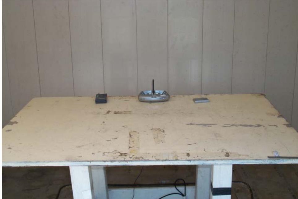
Figure 3.2 Radiated Front