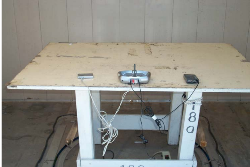
Figure 3.3 Radiated Rear